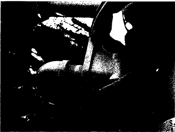
Figure 2. Meter #743434: Corrected regulator vent.