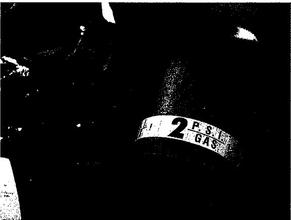
Figure 3. Meter #743434: Corrected regulator vent.