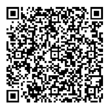
QR Code Link to This Post

Just run the items to another elevator. At the last stop, the truck was unloaded by the same crew who started the day and they were still going strong. They were polite, professional, and focused on getting the job done as promised. I really appreciate their great work and highly recommend them.