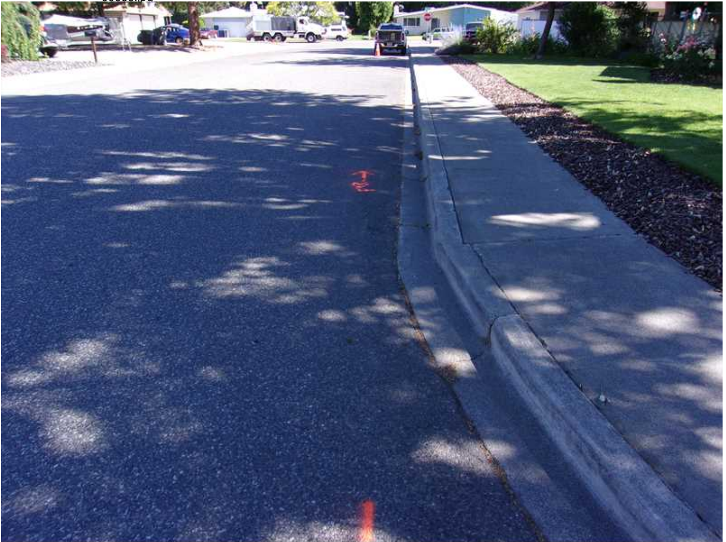
Property of United States Infrastructure Corporation Photo taken on 6/19/2017 9:20:16 AM