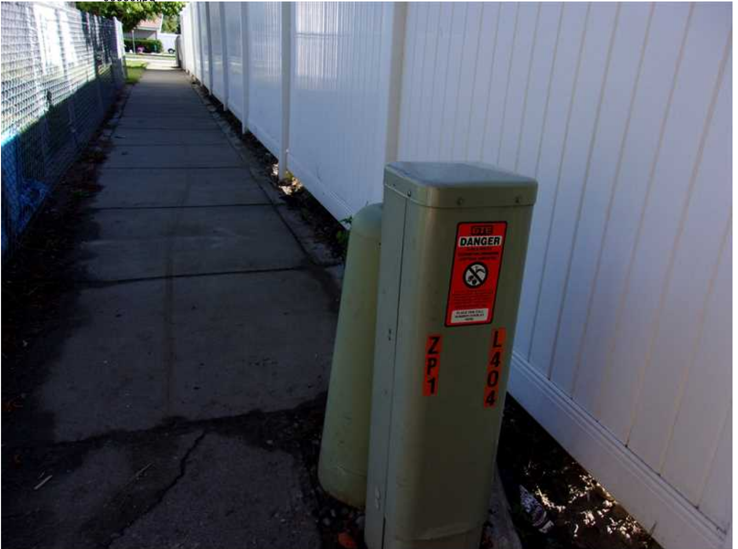
Photo taken on 6/19/2017 9:06:22 AM