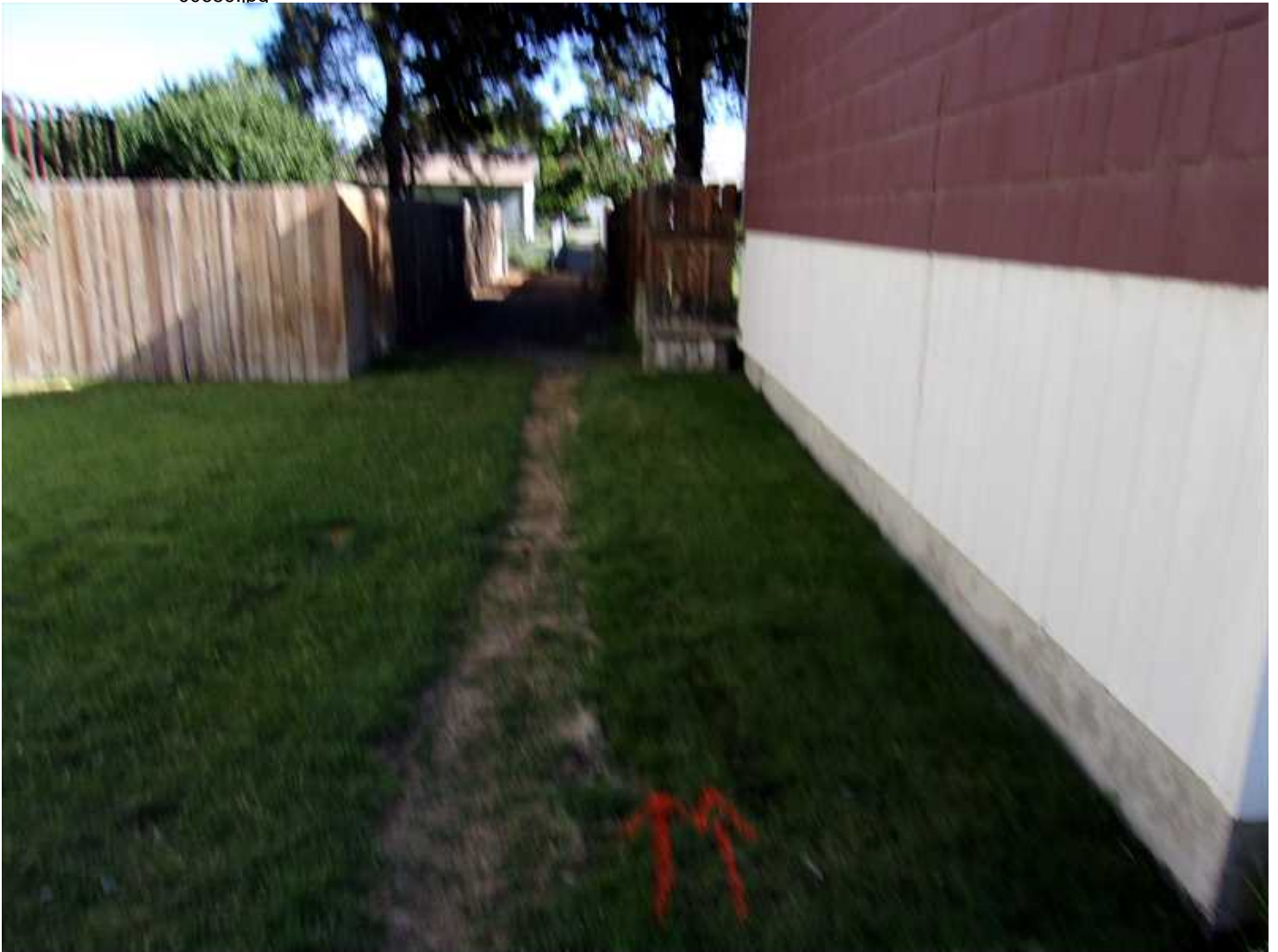
Photo taken on 6/19/2017 9:06:00 AM