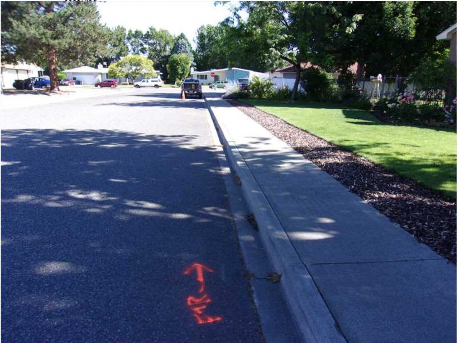
Property of United States Infrastructure Corporation Photo taken on 6/19/2017 9:20:20 AM