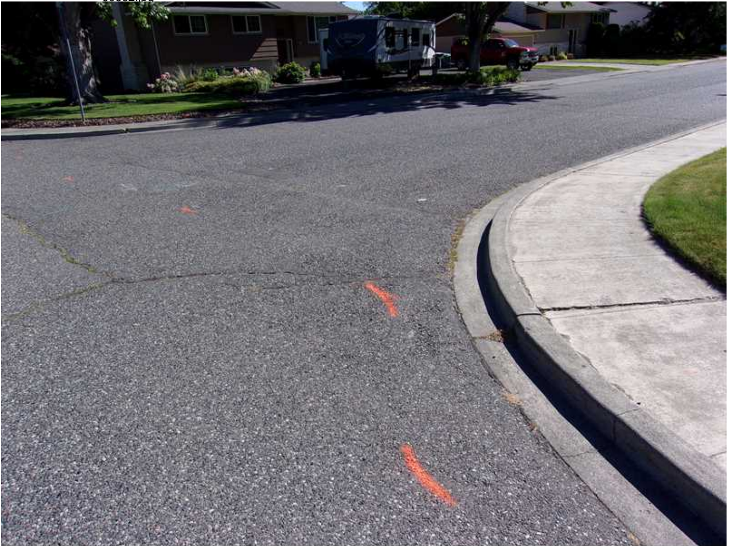
Property of United States Infrastructure Corporation Photo taken on 6/19/2017 9:19:04 AM