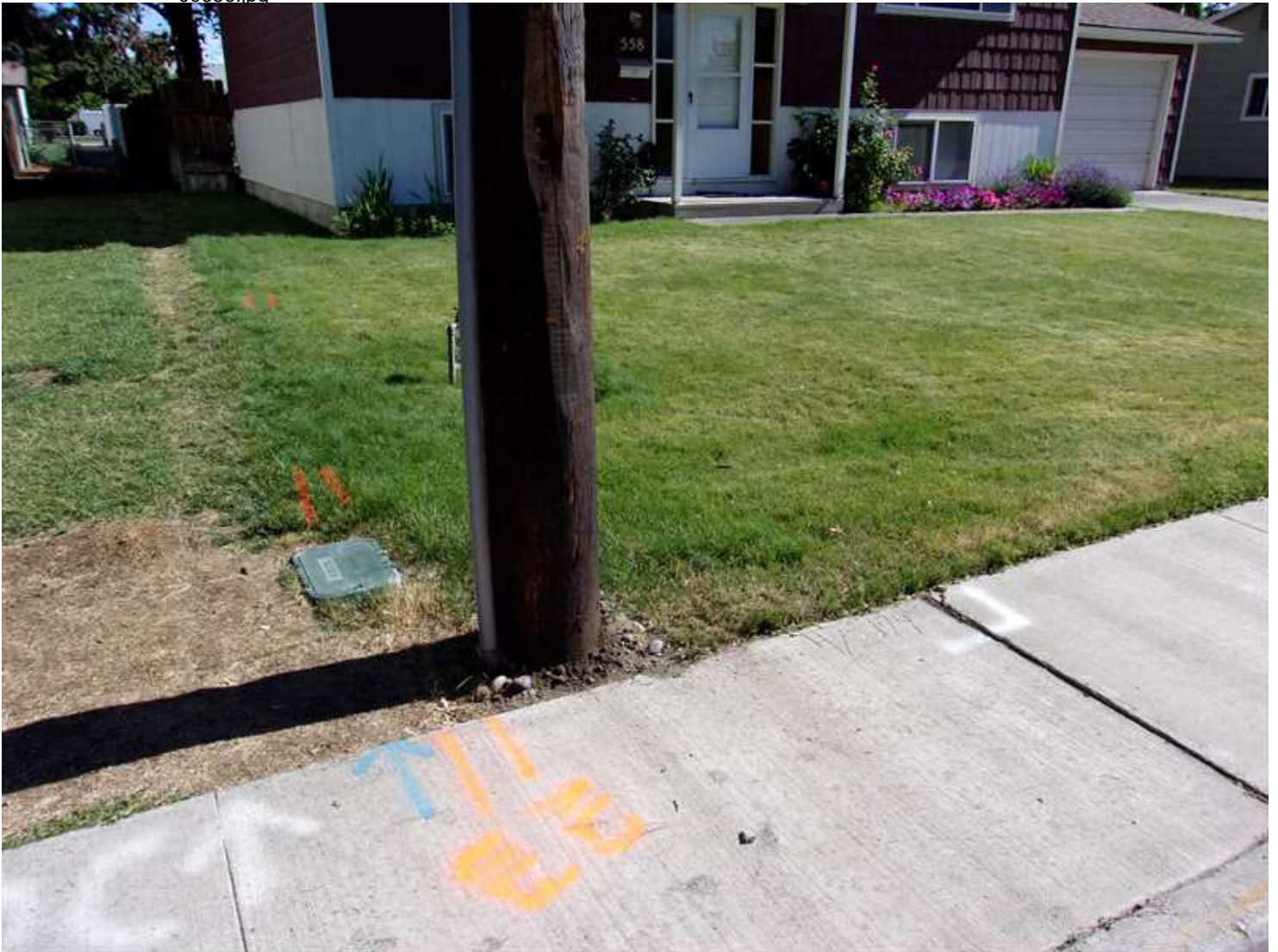
Photo taken on 6/19/2017 9:05:36 AM