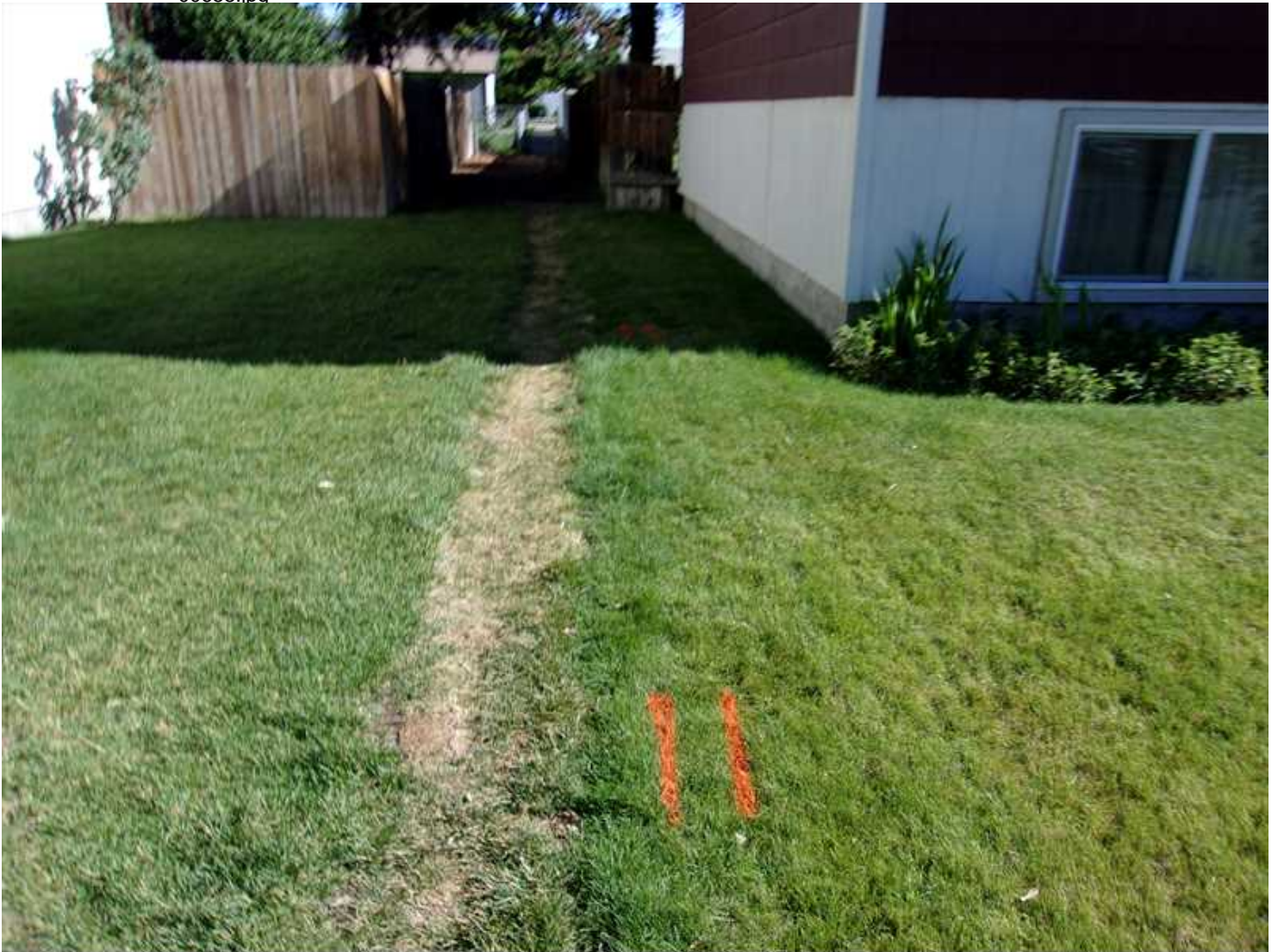
Property of United States Infrastructure Corporation Photo taken on 6/19/2017 9:05:56 AM