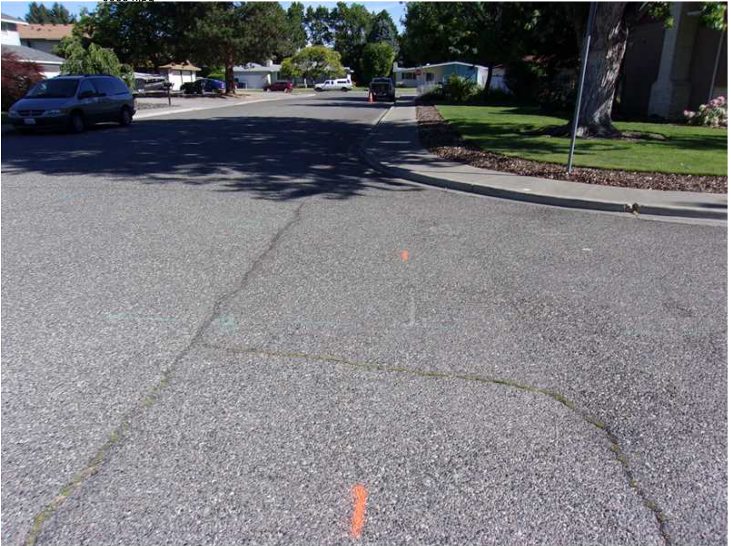
Photo taken on 6/19/2017 9:19:12 AM