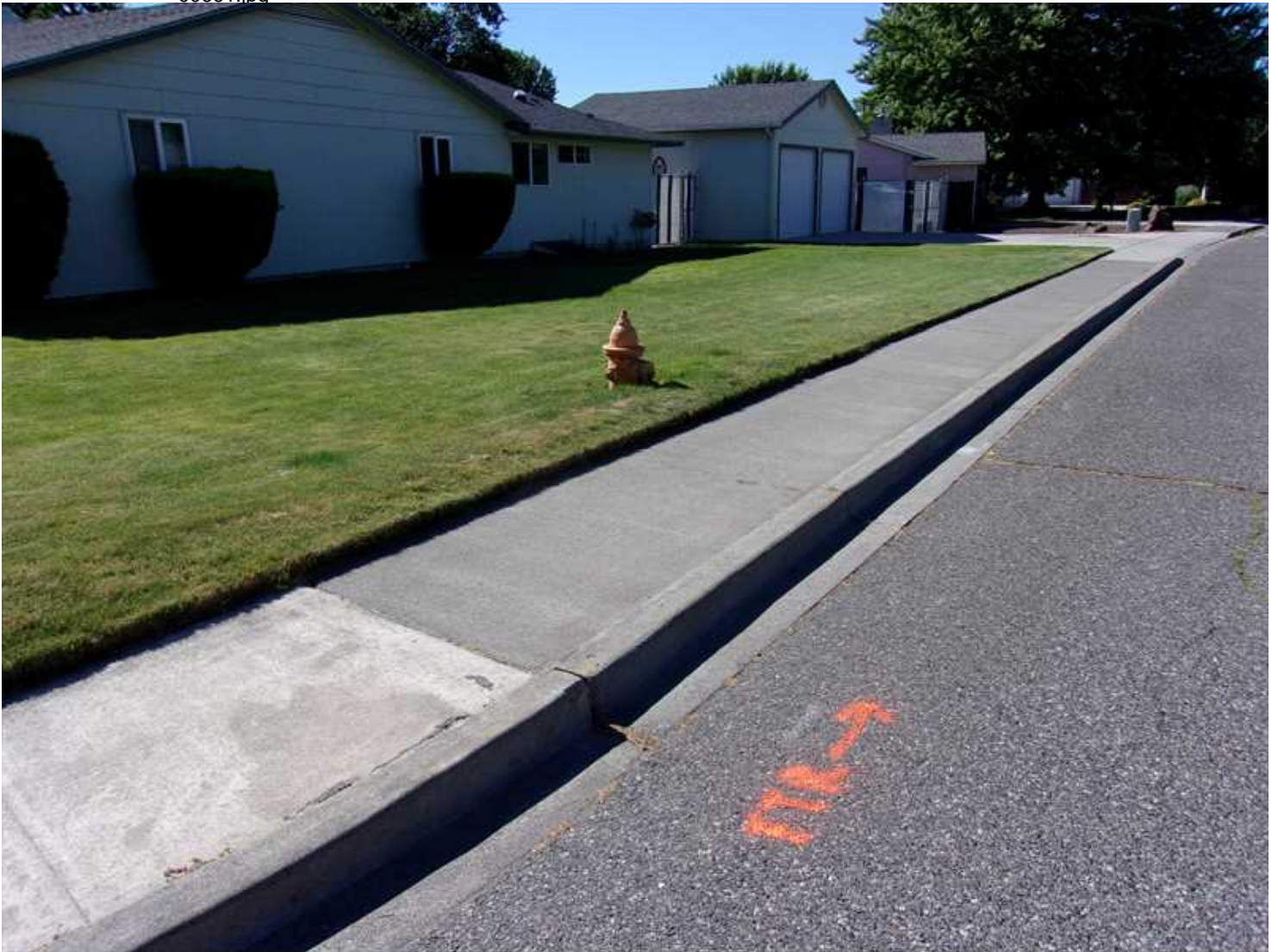
Photo taken on 6/19/2017 9:19:00 AM