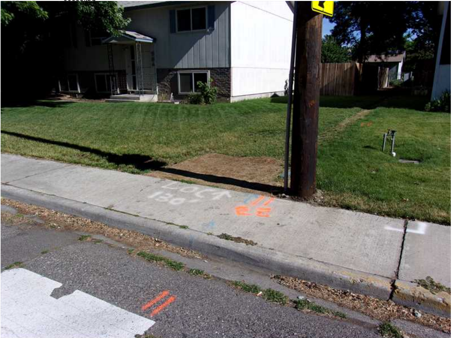
Property of United States Infrastructure Corporation Photo taken on 6/19/2017 9:05:32 AM