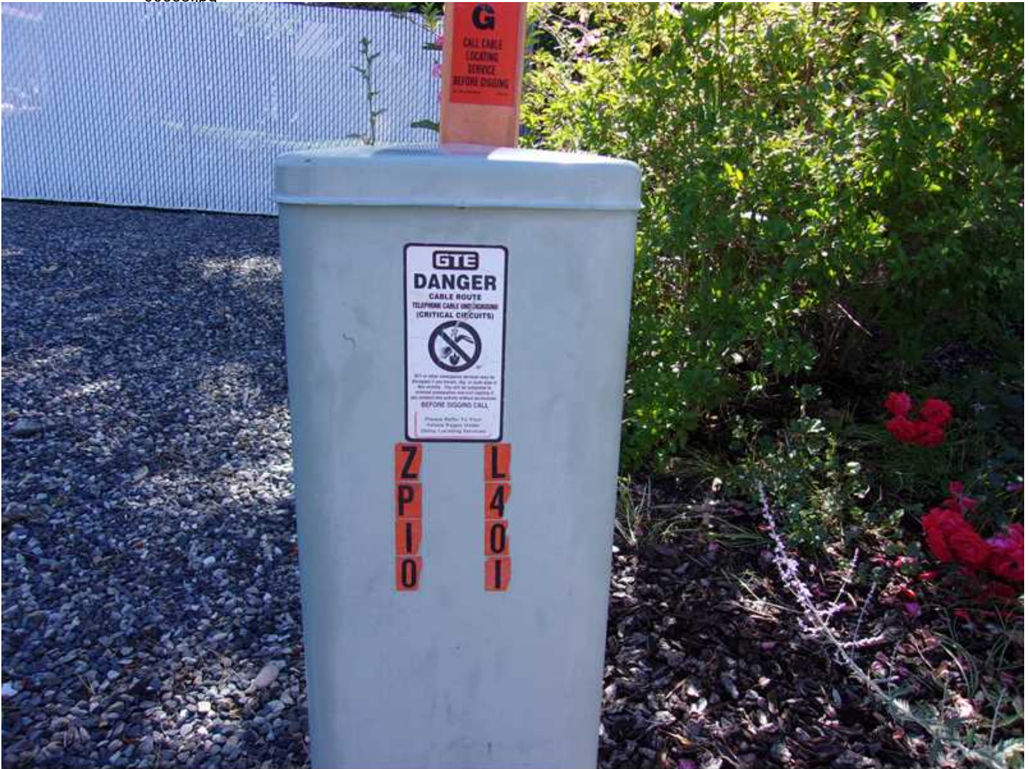
Photo taken on 6/19/2017 9:23:50 AM