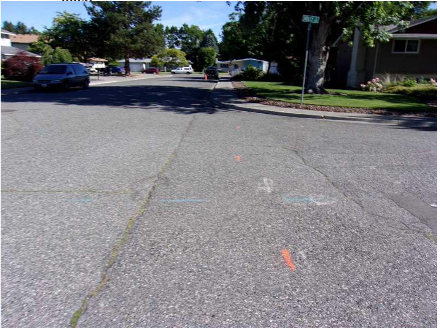
Photo taken on 6/19/2017 9:19:08 AM