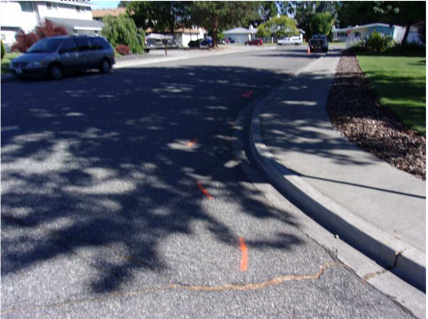
Photo taken on 6/19/2017 9:20:10 AM