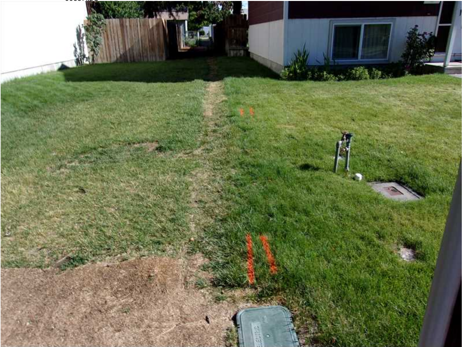
Photo taken on 6/19/2017 9:05:52 AM