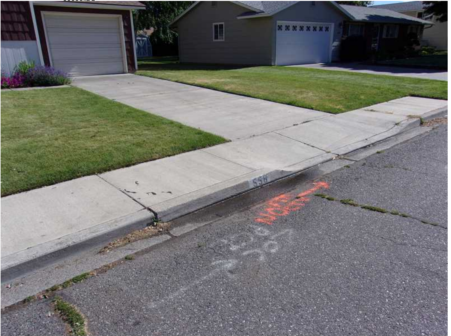
Photo taken on 6/19/2017 9:05:18 AM