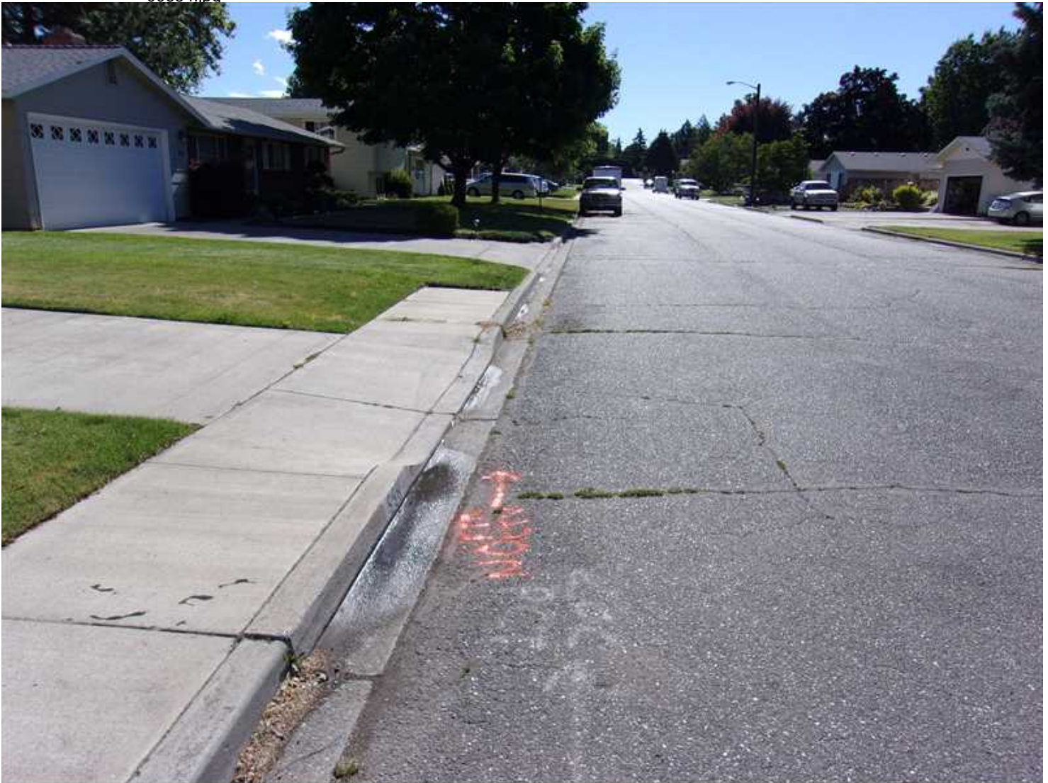
Property of United States Infrastructure Corporation Photo taken on 6/19/2017 9:05:22 AM