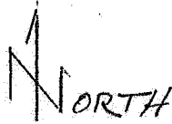
EXHIBIT - E