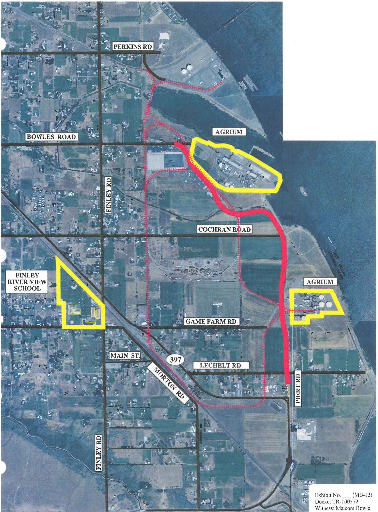
Exhibit No. ____ (MB-12) Docket TR-100572 Witness: Malcom Bowie