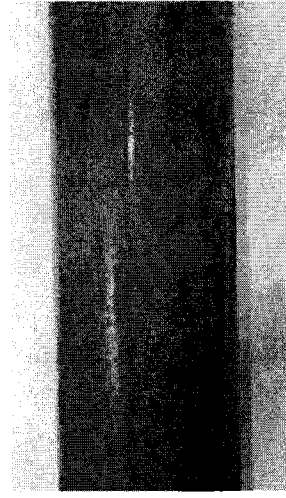
Aldyl A Pipe

This publication is an effort to increase your awareness of a particular type of plastic gas pipe in Avista gas distribution system. This type of pipe is known as Aldyl A. The pipe is pink to salmon in color, but has been known to turn shades of grey. Avista installed this type of pipe in the late 1960's through the early 1990's. Although it is very important to treat all gas lines with extreme caution and care, we would like to put a higher emphasis on the handling and care of our Aldyl A polyethylene pipe.