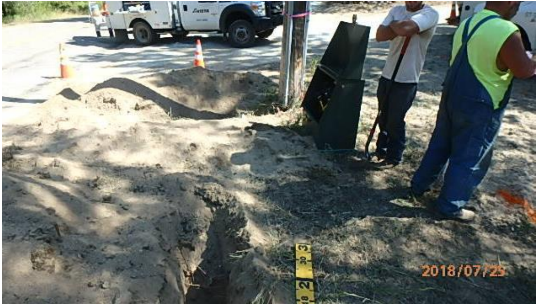
Attachment D: Pictures of damage location showing the pole and the date of the damage