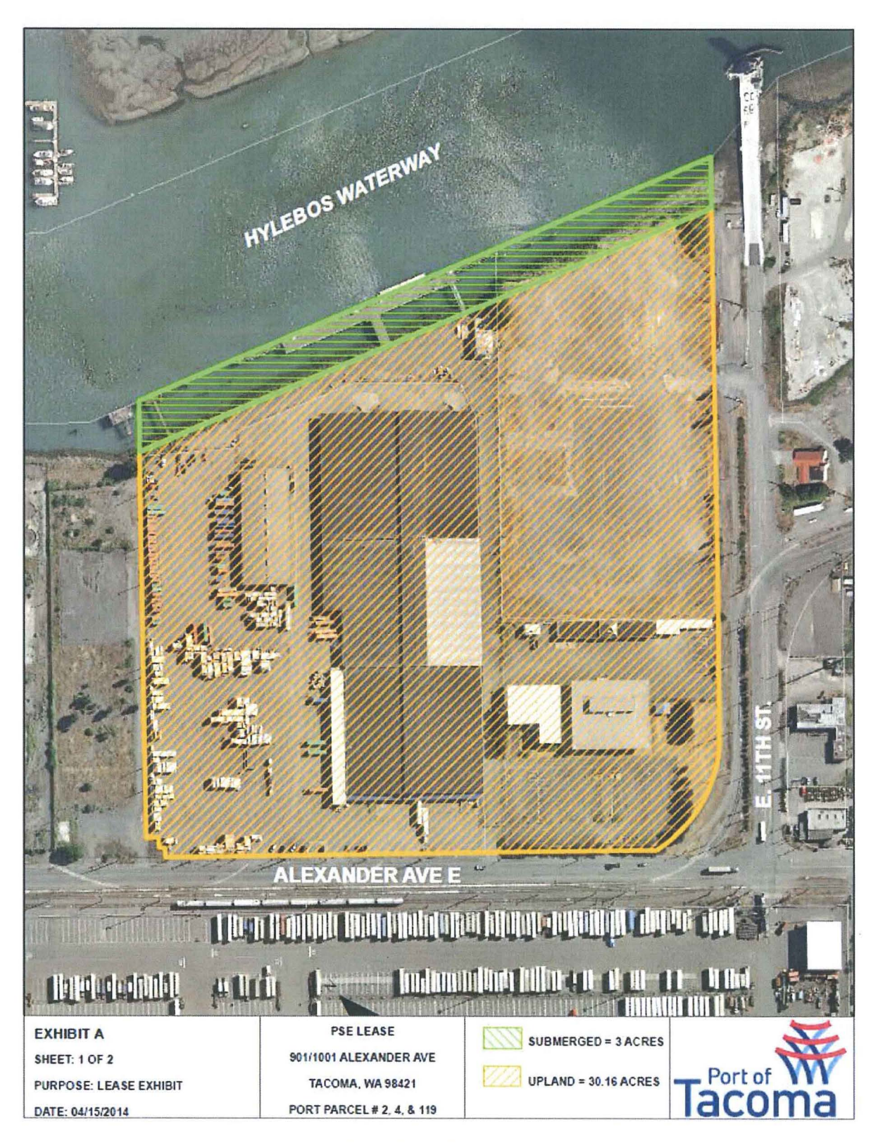
EXHIBIT A PREMISES