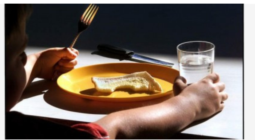
Buck up son, it's either that or candles and more blankets.