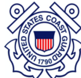
United States Coast Guard