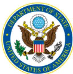
Department of State