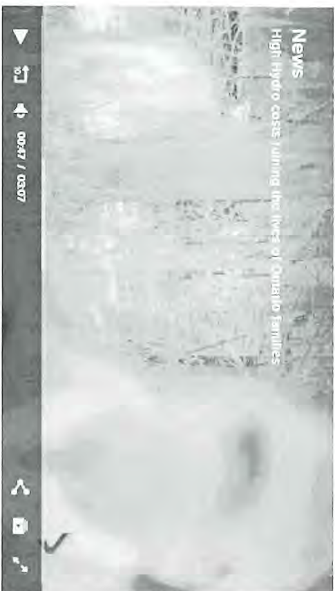
WATCH | High Hydro costs ruining the lives of Ontario families