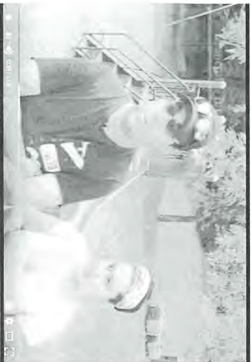
weather/Climate Network / in the Province of Ontario, International Ontario