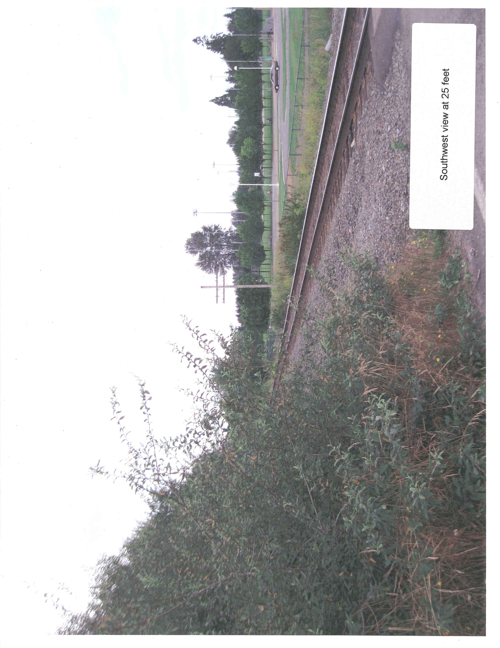
Southwest view at 25 feet