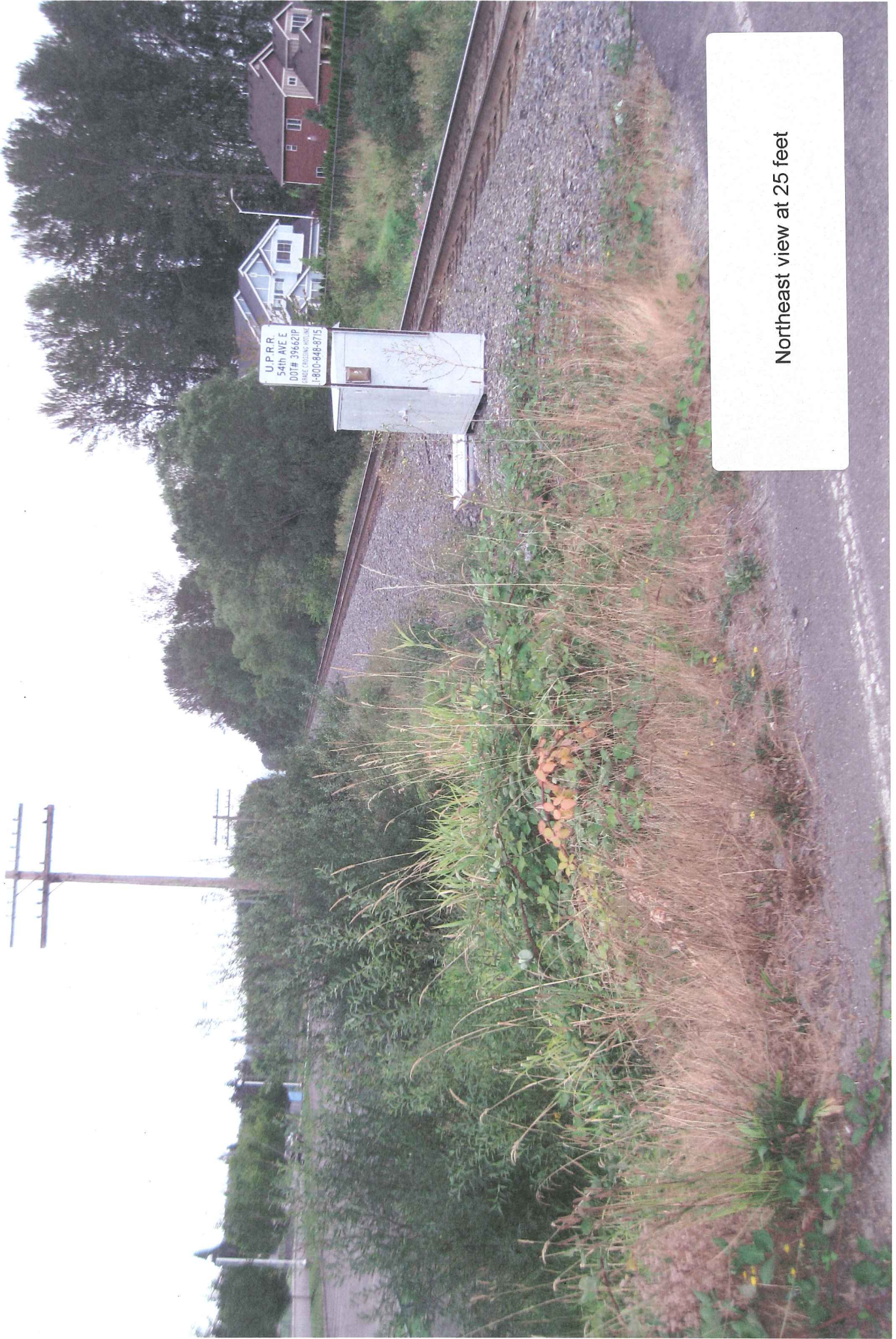
Northeast view at 25 feet