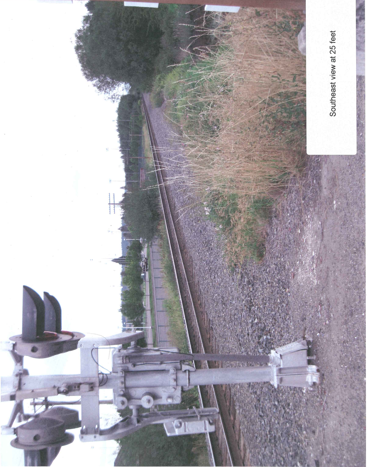
Southeast view at 25 feet