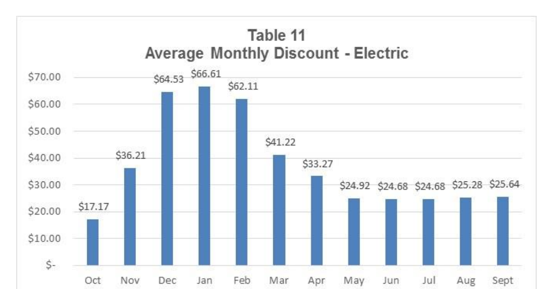
Table 11 – Average Monthly Discount per Customer - Electric

The goal of the Rate Discount Pilot is to provide each participating household with total annual discounts of approximately $300 for their service type. On average, customers participating in the Electric discount program received a total annualized benefit of $446.31 or an average monthly discount of $37.19. For Natural Gas customers participating in the pilot, the annualized average discount was $306.86 or an average monthly discount of $25.57. Please see the below tables to illustrate the monthly average discounts received by Rate Discount participants.