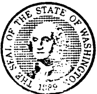
EXHIBIT B PAGE 1 of 2