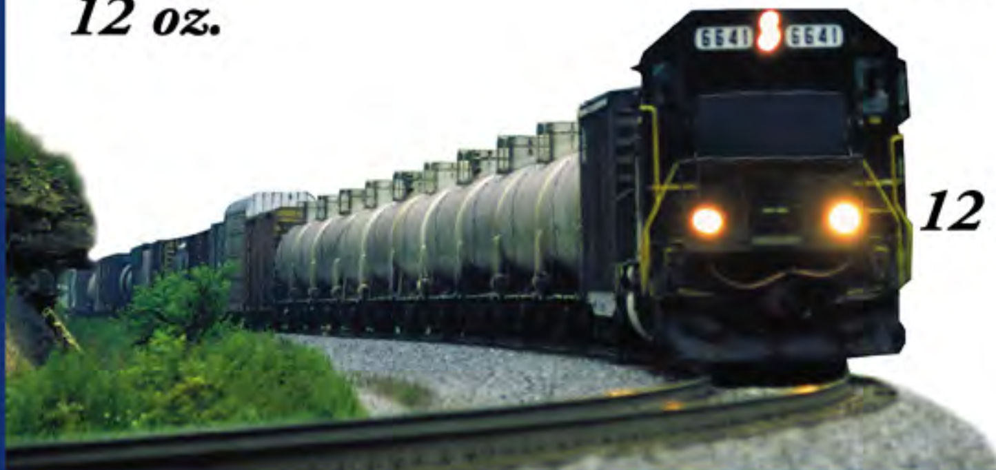
12 million lbs.