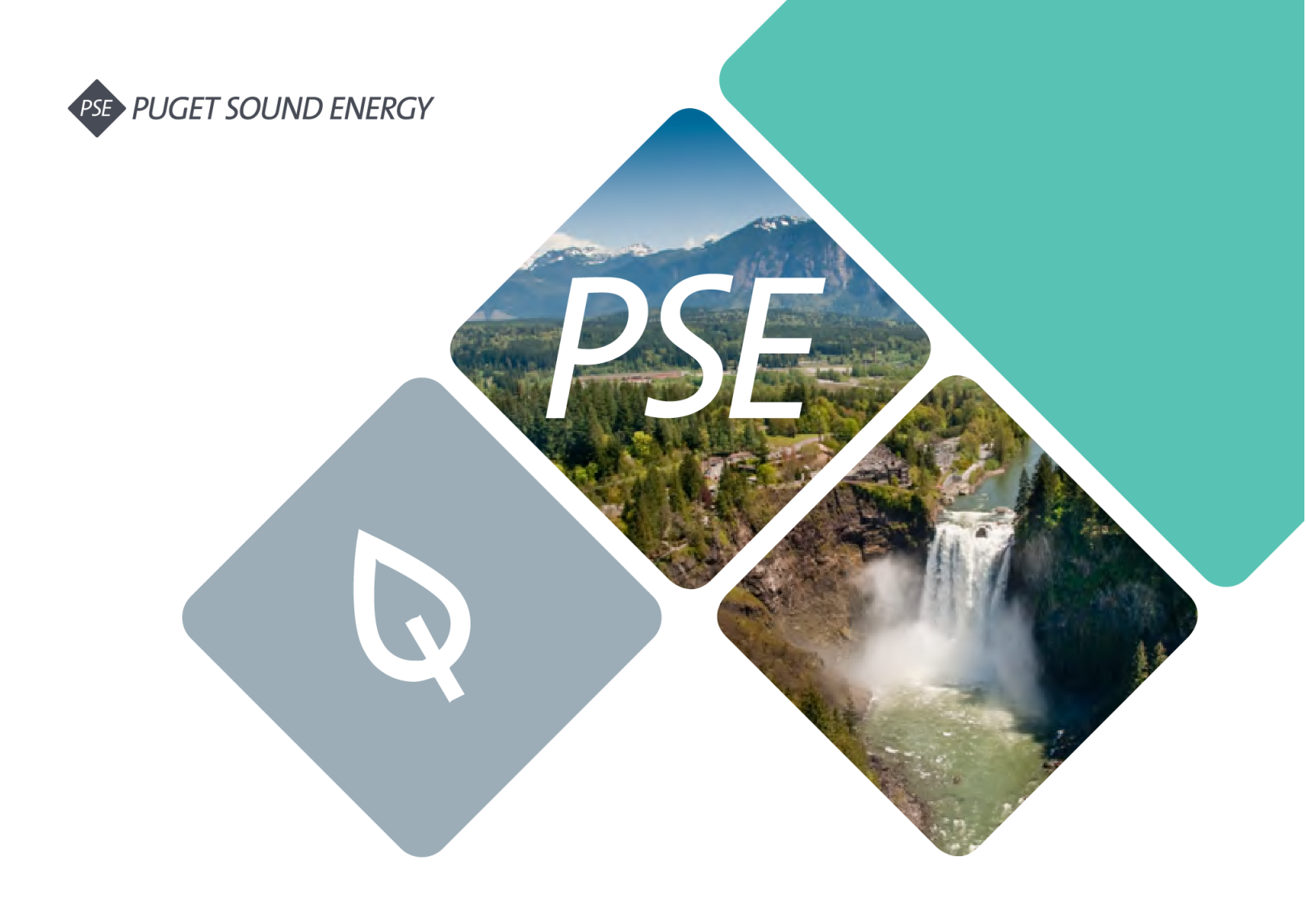
Exhibit 3 2022 Program Details