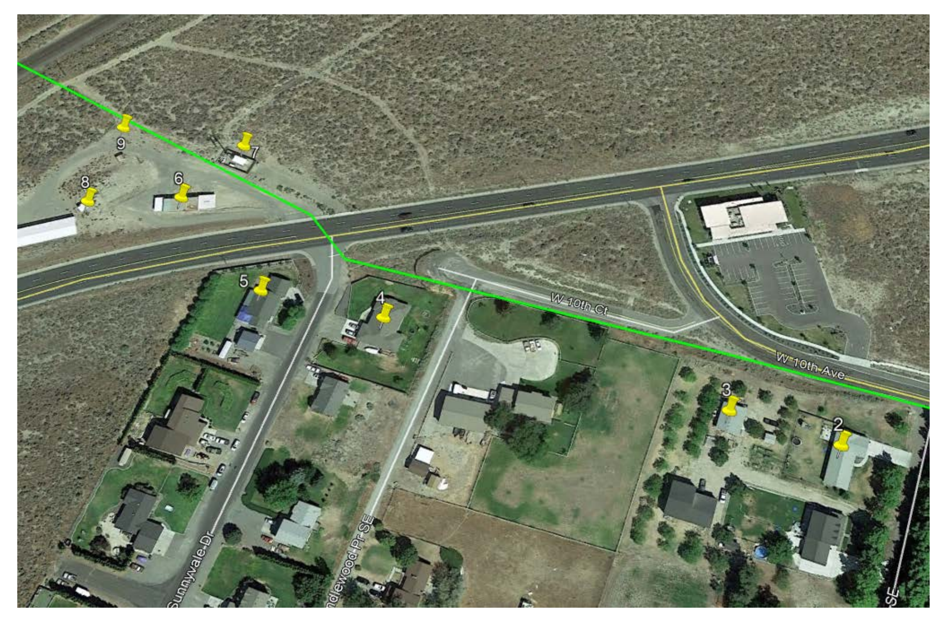
Figure 3: Buildings 2-9 that are within 100-feet of the proposed pipeline.