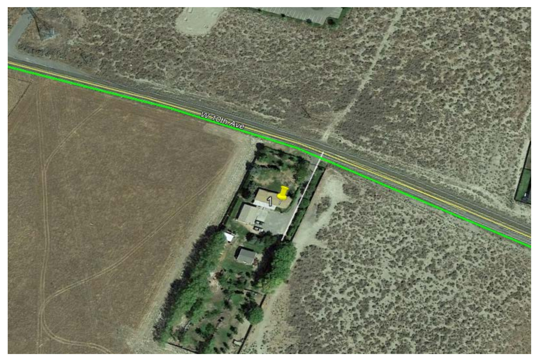
Figure 2: Building 1 that is within 100-feet of the proposed pipeline.