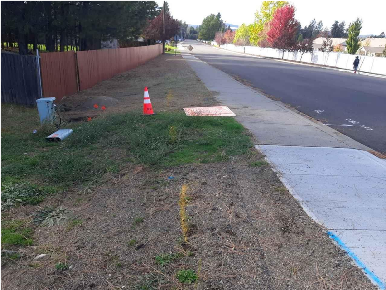
Ticket: 21440305.0 Timestamp:10/6/2021 1:57:28 PM