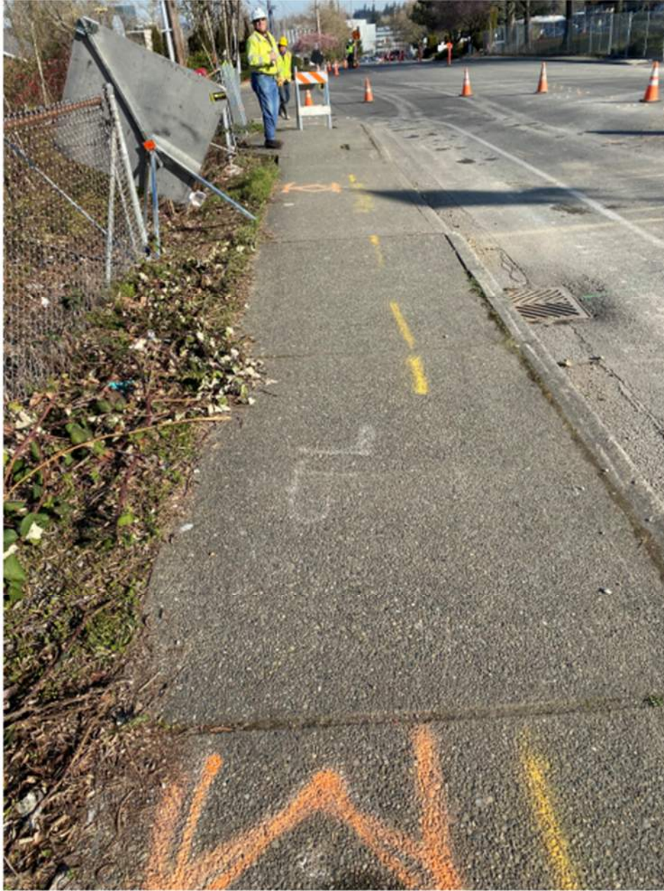
Photo Caption: photo of locate marks north of where potholing was completed on Talbot road – locate marks inaccurate by 6'+