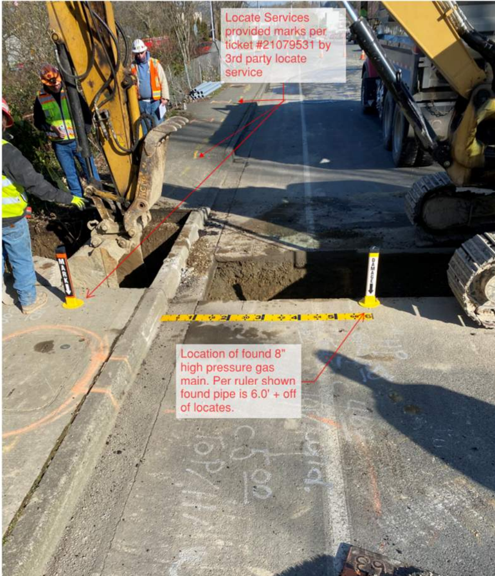
Photo Caption: Open trench where 8" high pressure gas main (PSE) was found vs where locate marks were provided