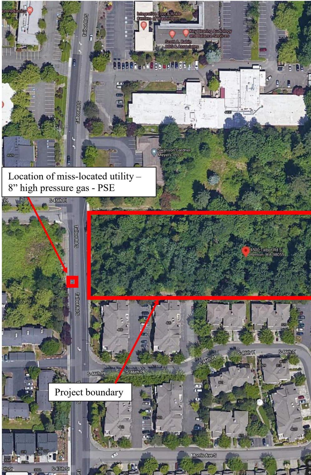
Photo Caption: Vicinity map with location of utility miss locate JCC PHOTO #001