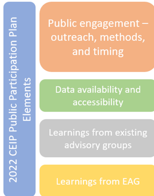
Figure 1- PacifiCorp processes to support CEIP public participation

In compliance with WAC 480-100-655(2), PacifiCorp d/b/a Pacific Power & Light Company (PacifiCorp or company) is pleased to establish this plan to encourage public participation throughout the development of the 2022 Clean Energy Implementation Plan (CEIP). The public participation plan is intended to address the ways in which PacifiCorp will seek and incorporate robust public feedback to inform the preparation and filing of the 2022 CEIP. PacifiCorp envisions public participation for the 2022 CEIP to be built upon four pillars that support robust and inclusive participation: (1) Engaging members of the public by selecting outreach, methods, timing, and language considerations that address barriers to participation, 1 (2) making data accessible and available to members of the public and CEIP stakeholders, 2 (3) building upon learnings from existing advisory groups, 3 and (4) building upon learnings from the Equity Advisory Group (EAG). The “four pillars” approach is shown in the Figure 1 below.