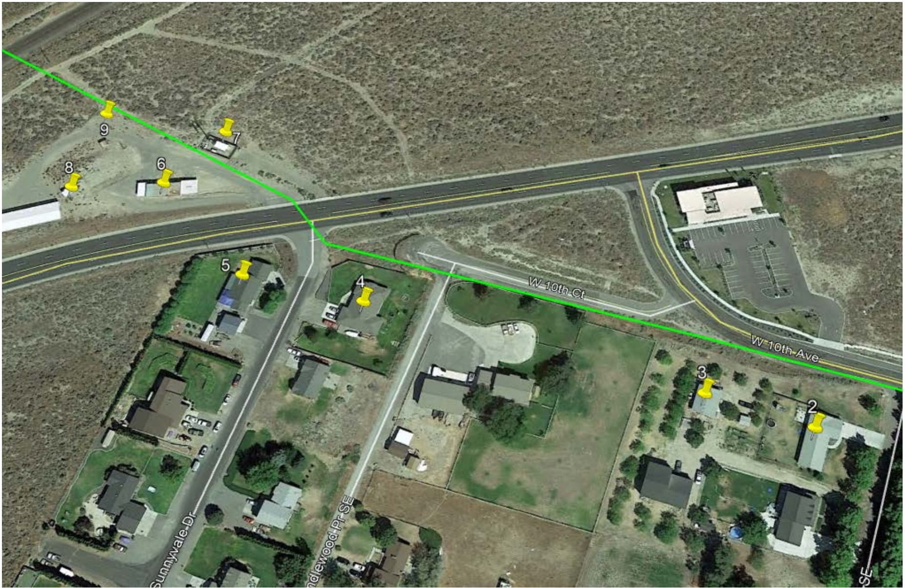
Figure 3: Buildings 2-9 that are within 100-feet of the proposed pipeline.