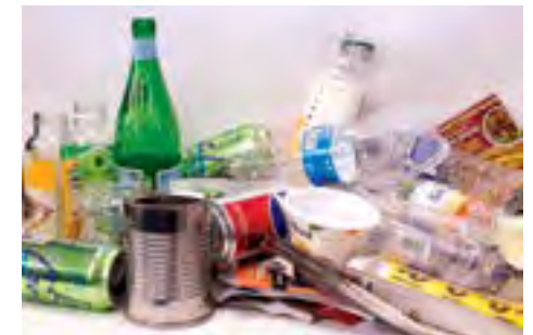
One of the easiest ways to recycle right is to make sure what you're putting in the recycling bin is empty, clean, and dry.