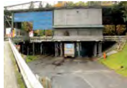
The 50-year-old Algona Transfer Station (above) will be replaced with a modern recycling and transfer facility in south King County.