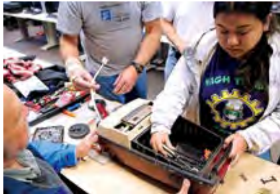
This young fixer is one of many experienced fixers who use their skills to repair and mend small household items and clothing at King County's free Repair Events. Visit KingCounty.gov/repair-events for more info.

*Excluding Seattle and Milton which have separate solid waste management systems.