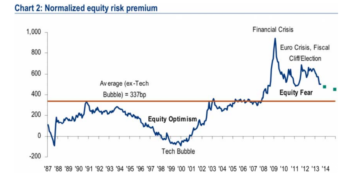
BofAML US Equity & Quant Strategy, Federal Reserve Board, Standard & Poor's, BLS

The chart below shows BAML's ERP forecast.