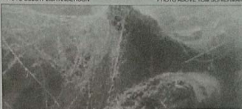
Divers discover this mass of fishing line, which has collected near the foot of Rock Lake. They estimate the web is at least 50 yards wide and five yards deep and say it creates an underwater hazard for habitat and recreationists.