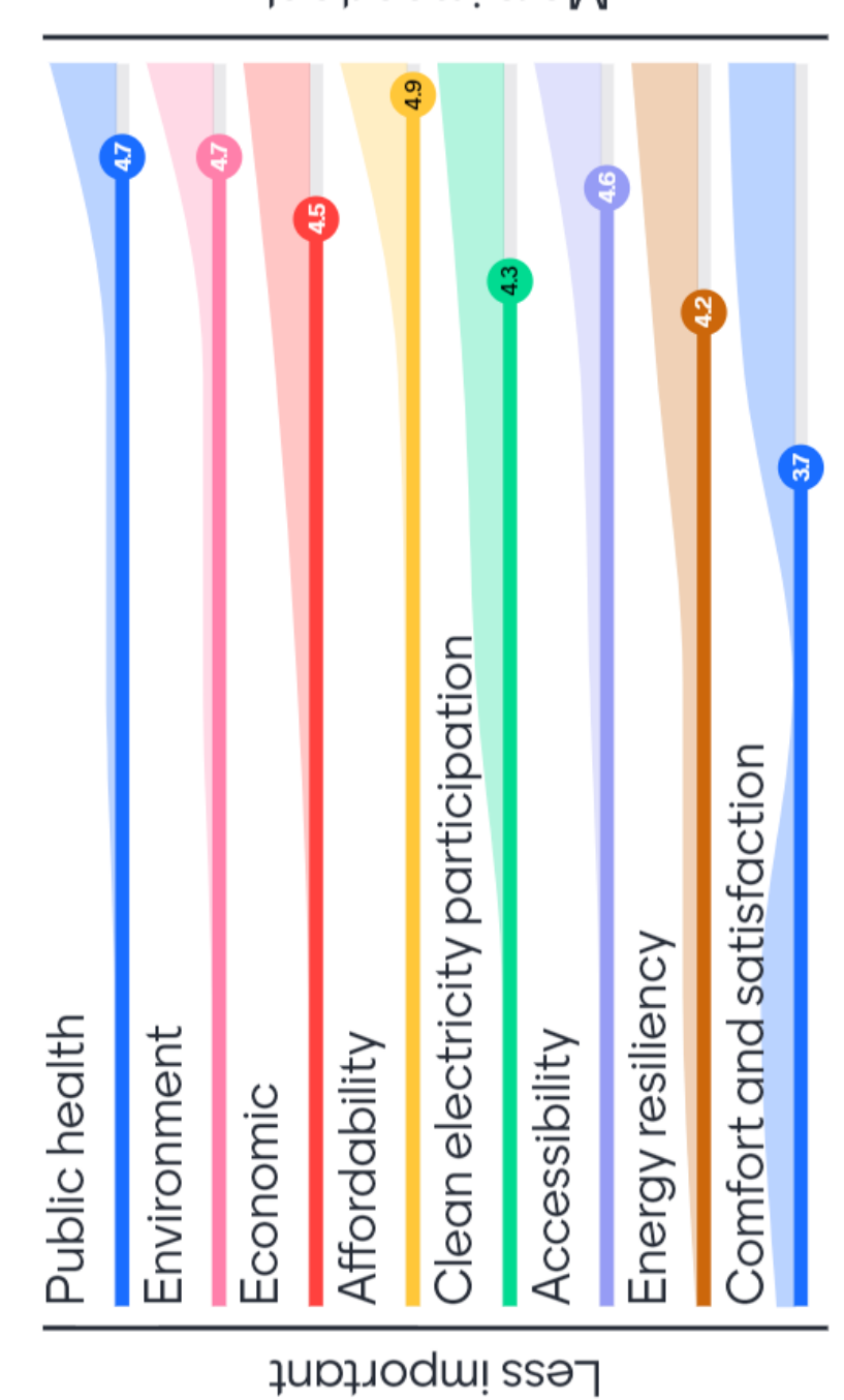
Ranking customer benefit categories