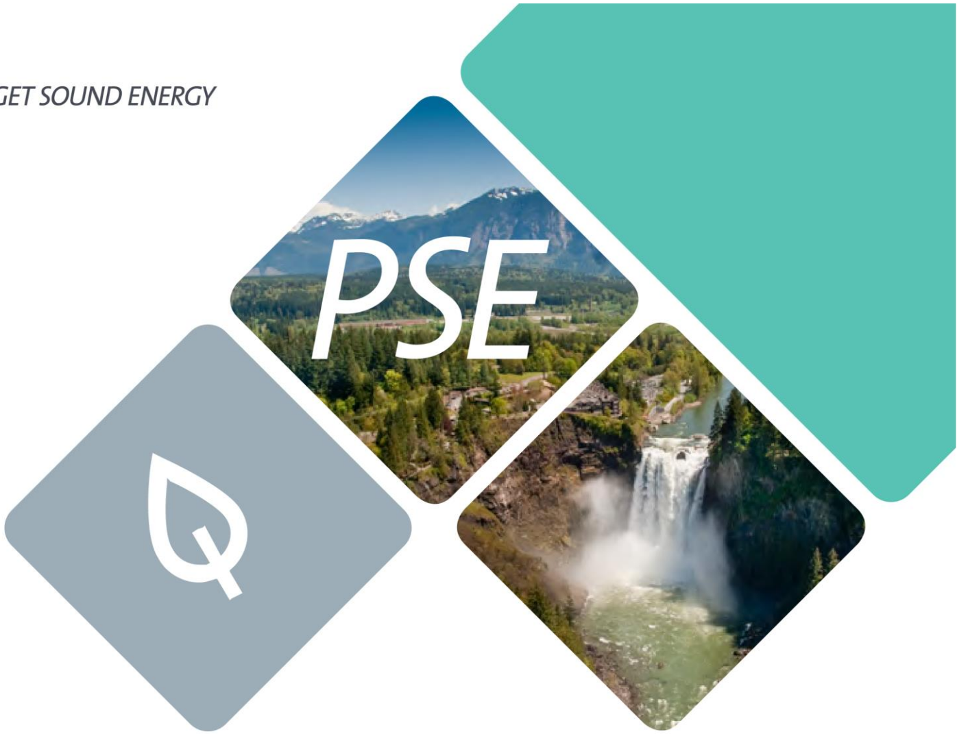
Exhibit 3, Supplement 1 Competitive Procurement and RFP Framework