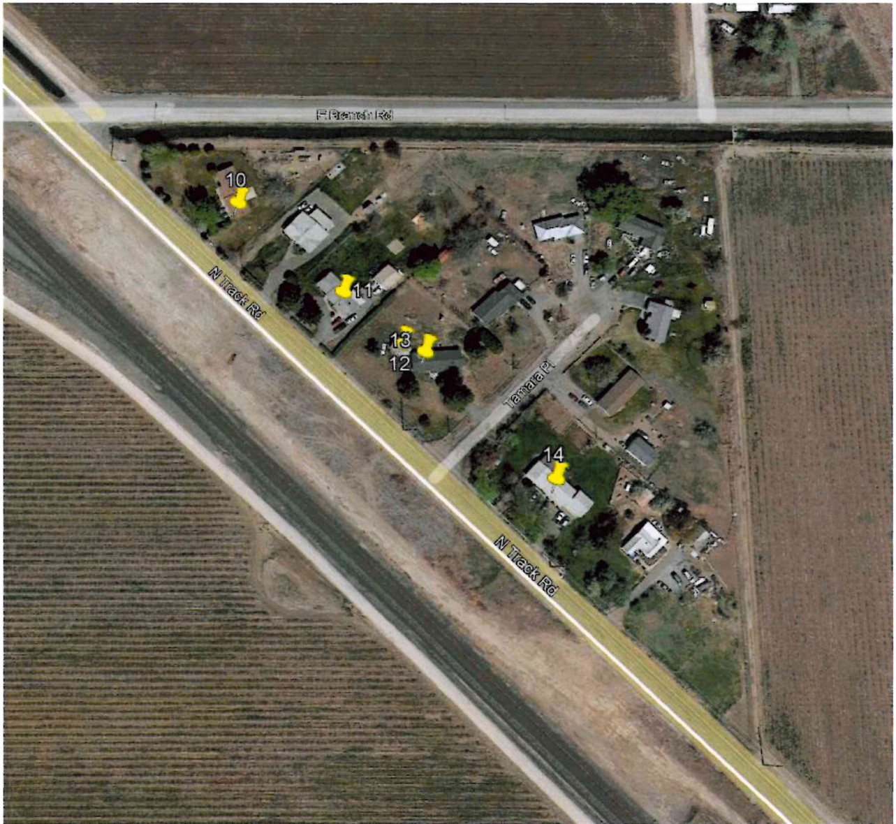
Figure 4: Section of the proposed pipeline showing buildings 10 - 14 within the 100-foot proximity boundary.