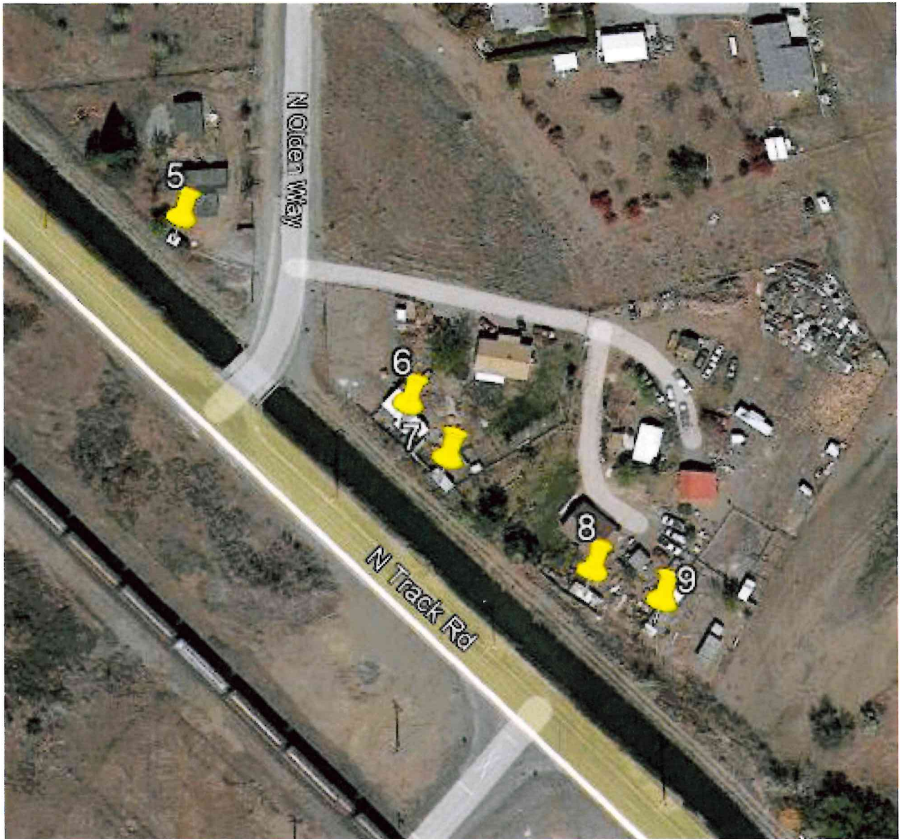
Figure 3: Section of the proposed pipeline showing buildings 5 - 9 within the 100-foot proximity boundary.