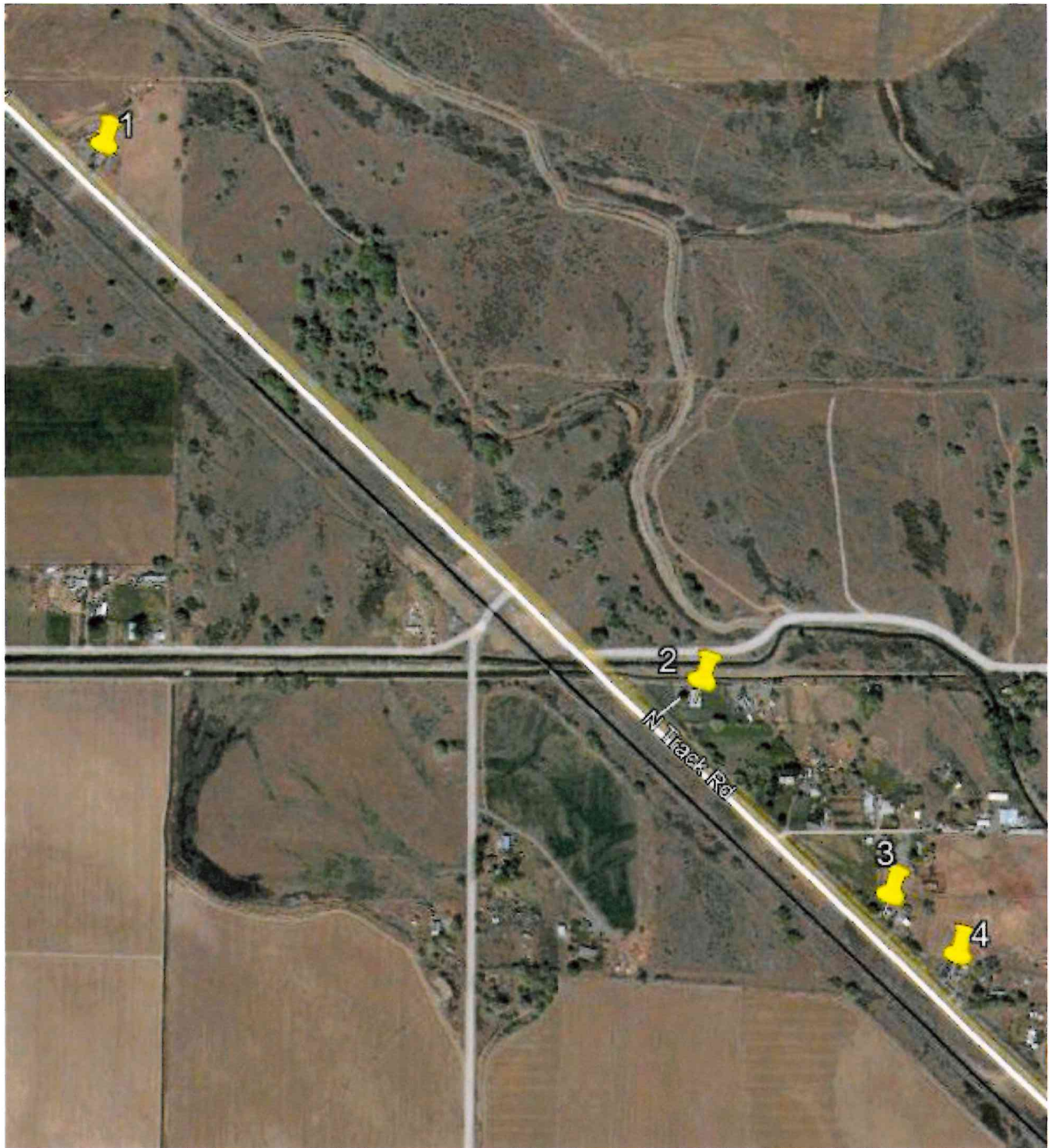
Figure 2: Section of the proposed pipeline showing buildings 1-4 within the 100-foot proximity boundary.