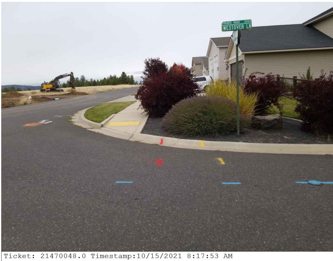
Exhibit C – Locate pictures

Comments: AVISTA-E - 10/14 c voelker; AVISTA-G - Out of time; AVISTA-E - 10/15 c voelker Located single phase electric on E side of road to out of the dig area. Dig area not marked for the job. Brian showed me where the dig area was. Only going to the water line in the middle of the street. After talking to someone on the phone he expanded the dig area to past the sidewalk on the E side of the street. Only located the single phase and no services.; AVISTA-G - Located 2" PE main on W side of street from stub to out of the dig area. Located 2" PE main on E side of the street. Did not locate any services.;