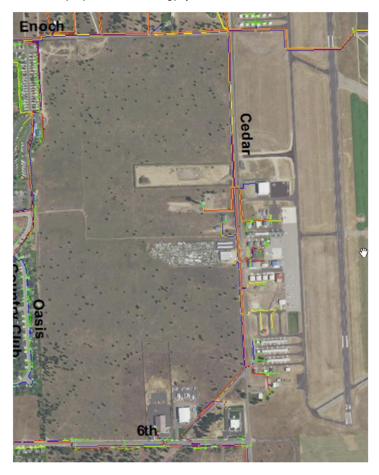
Exhibit A – Vicinity map of Cedar Rd excavating project