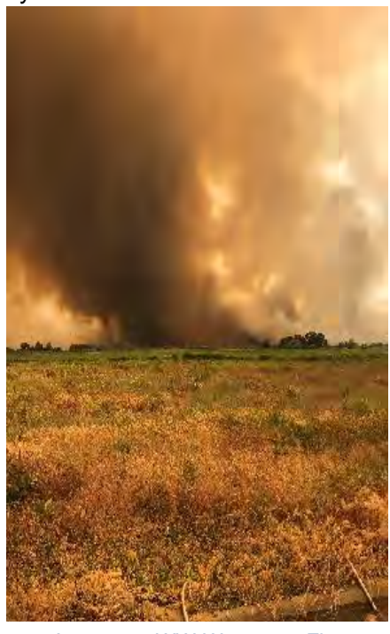
June 2019 WW-Wanapum Fire

In 2006, Avista adopted tubular steel poles as the 'standard installation' for 115 and 230 kV powerlines. Approximately 30% of Avista's transmission system is now steel and as circuits are reconstructed and poles replaced, that percentage will continue to increase. In 2009, NERC published the " Transmission Vegetation Management " standard FAC-003-2 which fundamentally reshaped the industry's approach to transmission line clearance activities. For Avista, the combination of system hardening and well maintained rights-of-way have increased the fire resiliency of the transmission system.