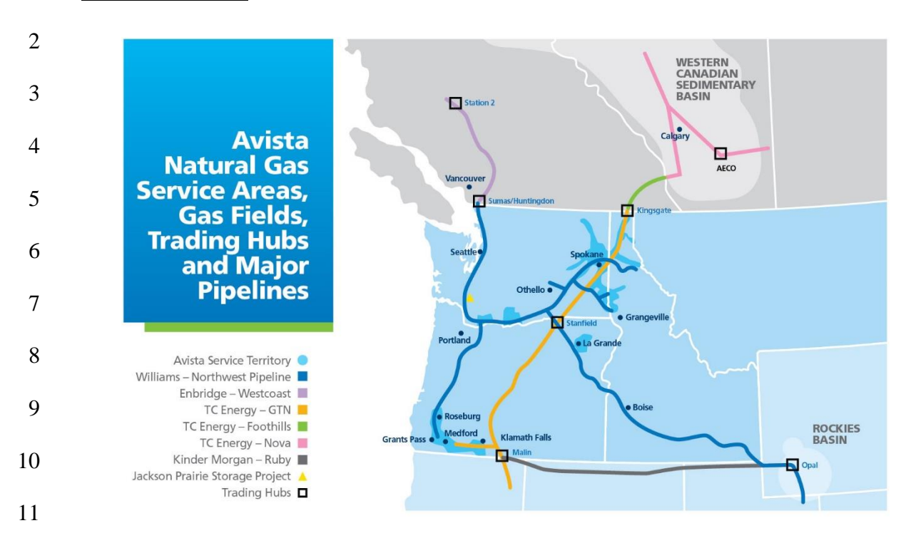
Illustration No. 1

Wholesale natural gas prices are a fundamental component of both procurement and integrated resource planning. Pacific Northwest natural gas prices can be affected not only by regional factors, but by global energy markets, and supply and demand factors from other regions within the United States and Canada. Price volatility and delivery constraints can have an impact on where our natural gas is sourced. Avista's diverse portfolio of natural gas supply resources allows the Company to make natural gas procurement decisions based on the reliability and economics that provide the most benefit to our customers.