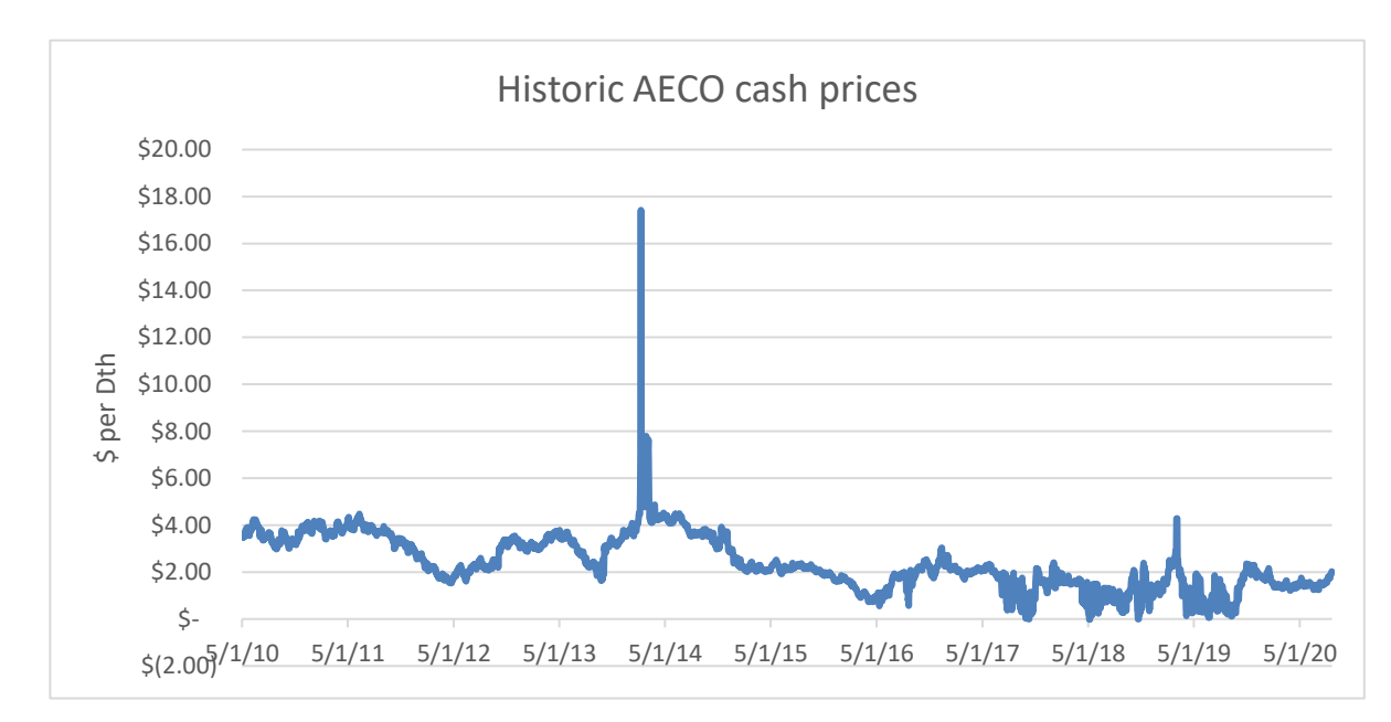
Illustration No. 3

Avista cannot predict with accuracy what natural gas prices may be. Our experience and intelligence related to market fundamentals guide our procurement decisions. By layering in fixed price purchases over time, setting upper and lower pricing levels on the Hedge Windows, managing the VaR of our LDC natural gas portfolio's open position on a daily basis, and actively managing storage resources, Avista is able to meet our goal of providing a meaningful measure of price stability and certainty, and competitive prices for our customers.