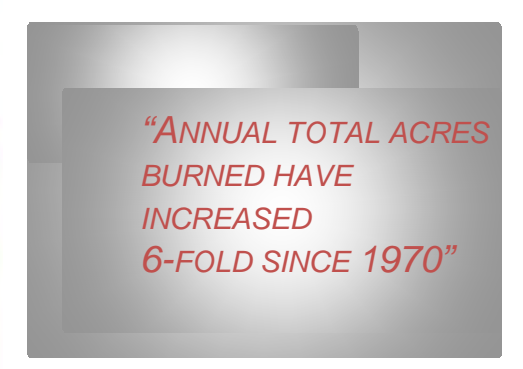
2016 Climate Central - Western Wildfires