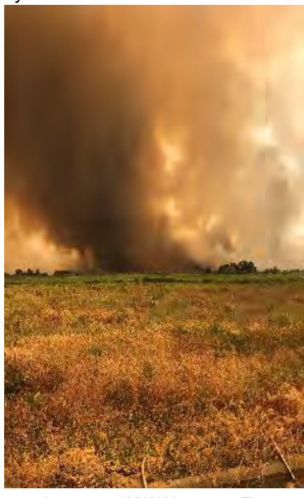
June 2019 WW-Wanapum Fire

In 2006, Avista adopted tubular steel poles as the 'standard installation' for 115 and 230 kV powerlines. Approximately 30% of Avista's transmission system is now steel and as circuits are reconstructed and poles replaced, that percentage will continue to increase. In 2009, NERC published the " Transmission Vegetation Management " standard FAC-003-2 which fundamentally reshaped the industry's approach to transmission line clearance activities. For Avista, the combination of system hardening and well maintained rights-of-way have increased the fire resiliency of the transmission system.