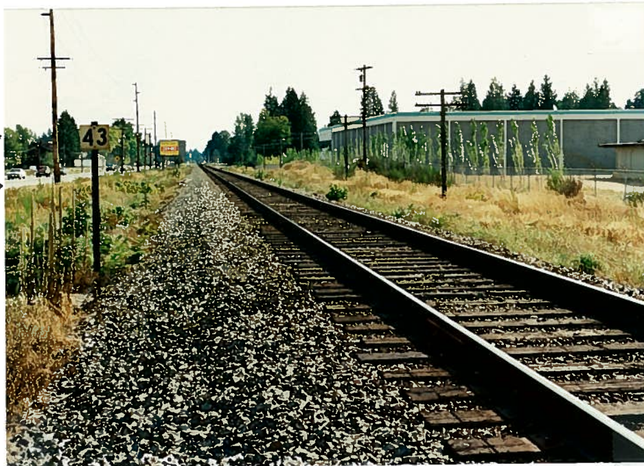
FROM SOUTH LOOKING NORTH @ MP 43 MARYSVILLE, WA.

MILEPOST 43 → SMOKEY PT. BLVD. (OLD 99) →