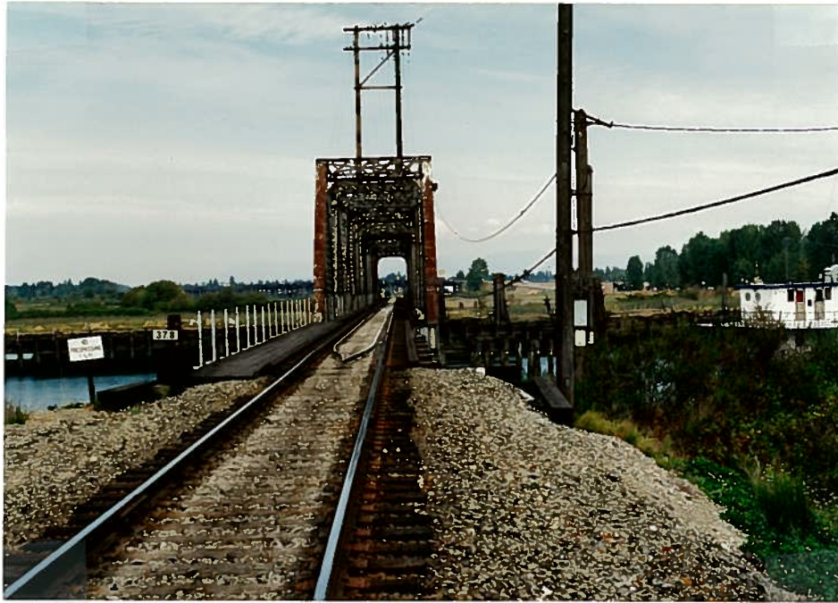
MAINLINE TRACK FROM SOUTH LOOKING NORTH @ MP 37.8 BRIDGE II OVER STEAMBOAT SLOUGH MARYSVILLE, WA.