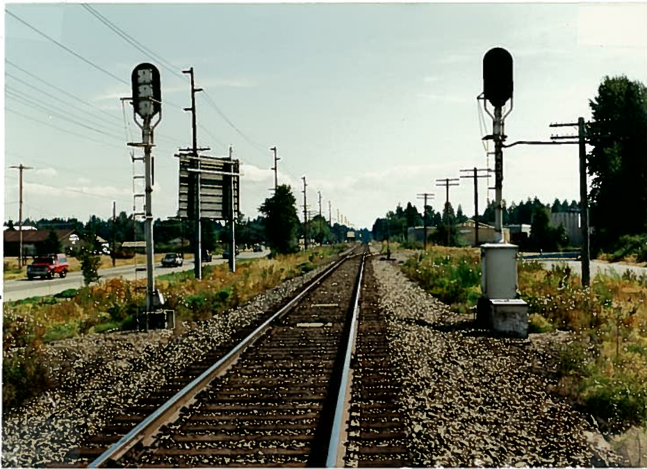
MAINLINE TRACK FROM SOUTH LOOKING NORTH @ MP 43.2 MARYSVILLE, WA.