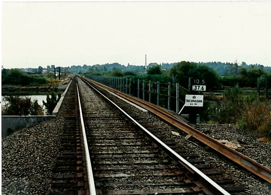
MAINLINE TRACK FROM SOUTH LOOKING NORTH @ MP 37.6 BRIDGE 10.5 OVER UNION SLOUGH