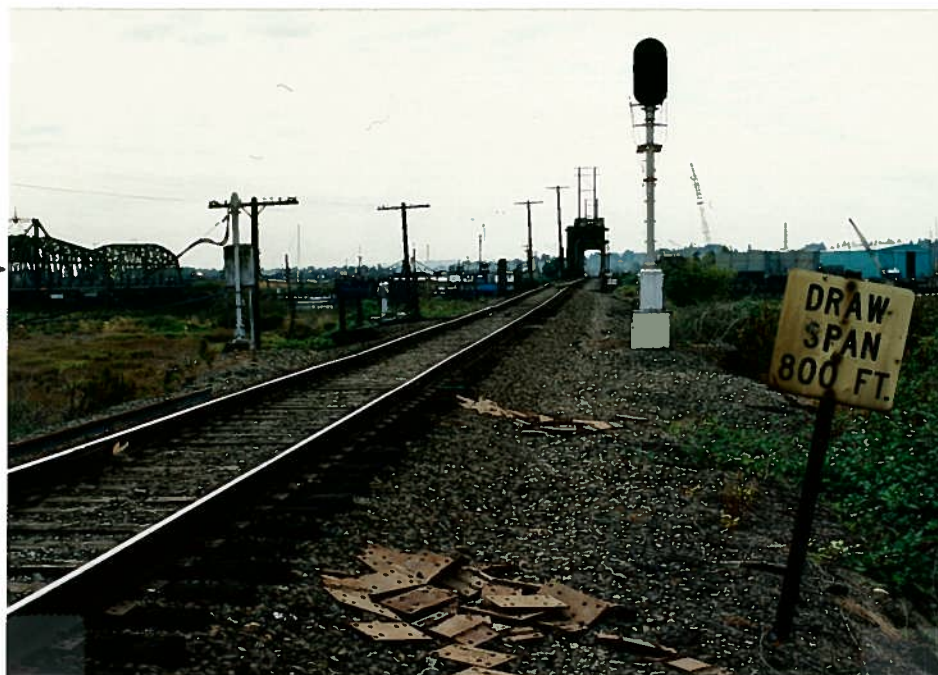
MAINLINE TRACK FROM SOUTH LOOKING NORTH @ MP 37.7 BRIDGE || NEAR CENTER OF PICTURE