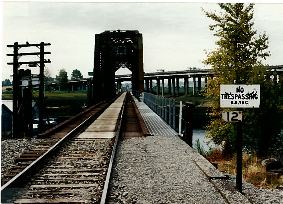
MAINLINE TRACK FROM SOUTH LOOKING NORTH @ MP 38.3 BRIDGE 12 OVER EBEY SLOUGH MARYSVILLE, WA.