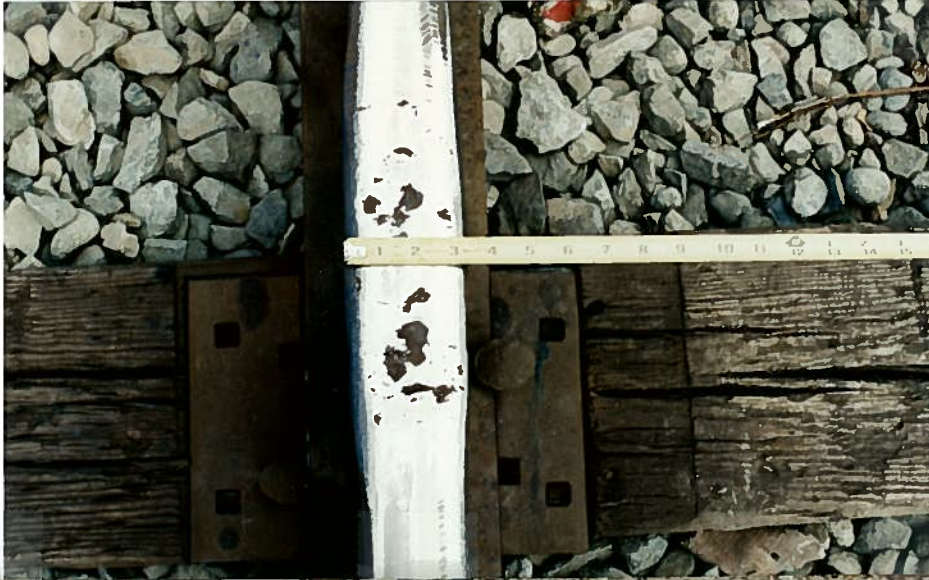
VIEW OF ENGINE BURNED RAIL @ MP 39.2 MARYSVILLE, WA, 115# CONVENTIONAL MAINLINE RAIL