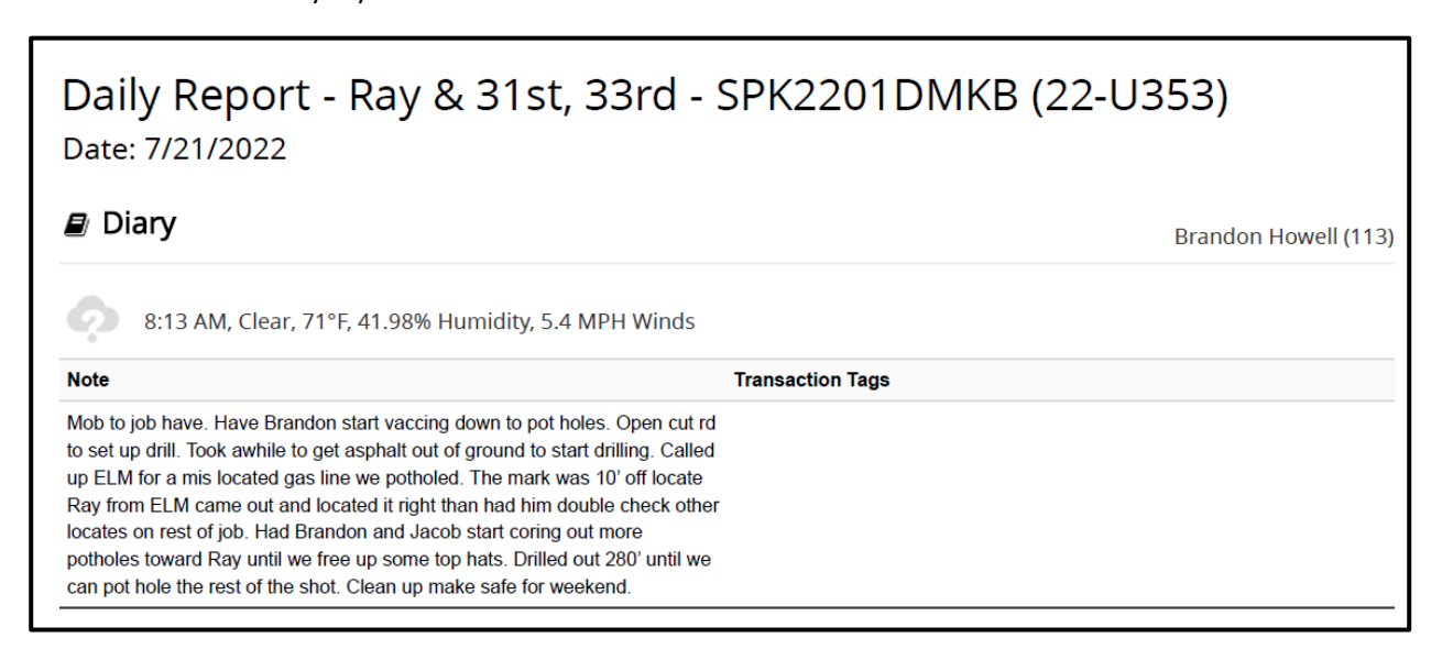
Exhibit 4 – M&L work log explaining they mobilized to the site to start potholing and set up their directional drill on 07/21/22.