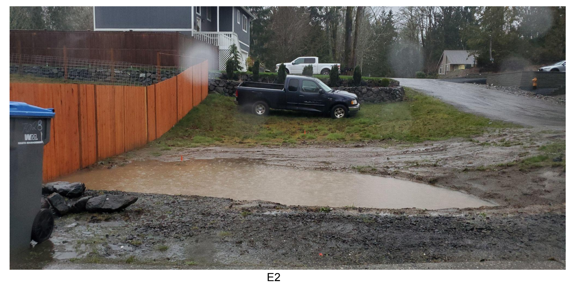
Photo E2 taken February 28, 2022 showing the water flood issue directly caused by the excavation after a heavy rainfall.