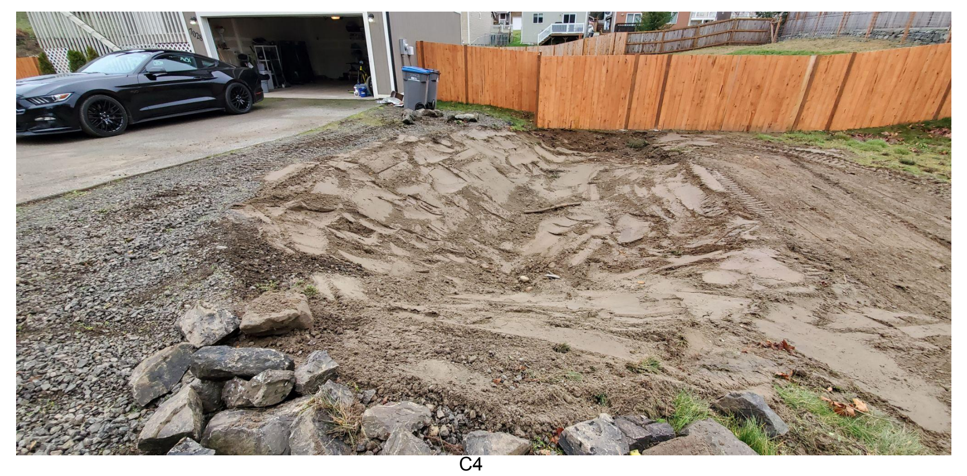
It appears that Mr. Freeland may have exposed the utility near the fence, and placed loose dirt above it to hide the power and internet lines. Still, no utility markings are present in this photo.