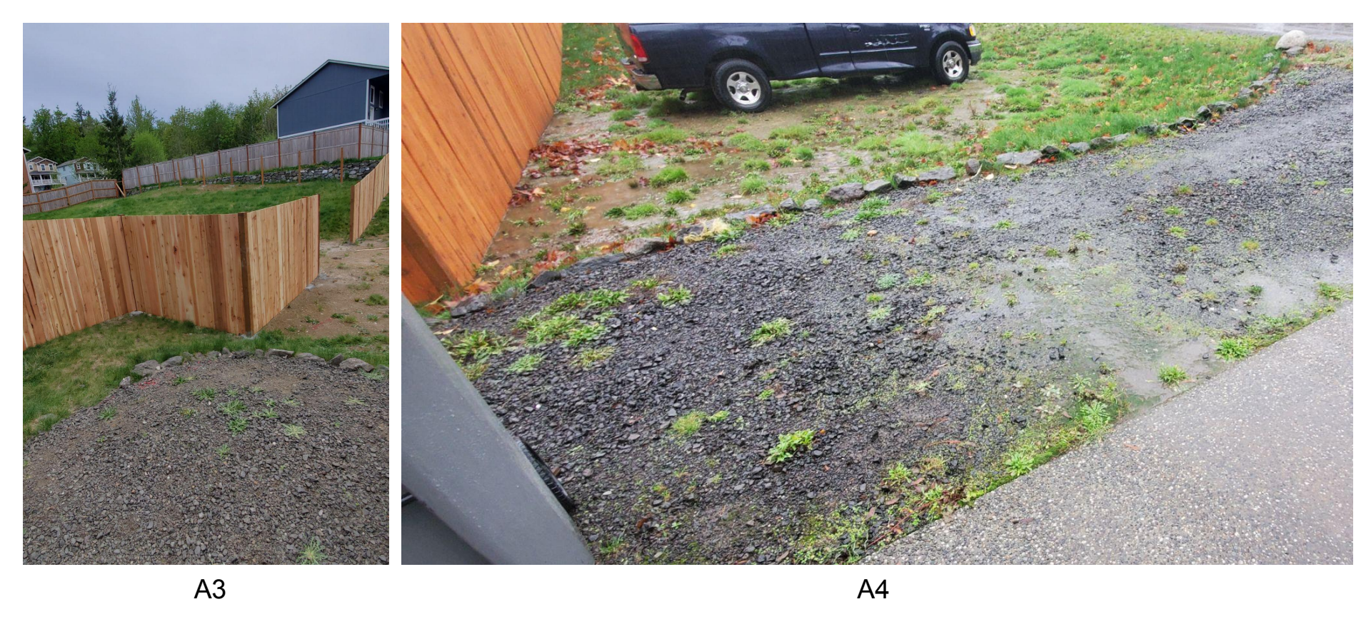
Photo A3 was taken April 28, 2021 (Utility markings still visible and away from fence)