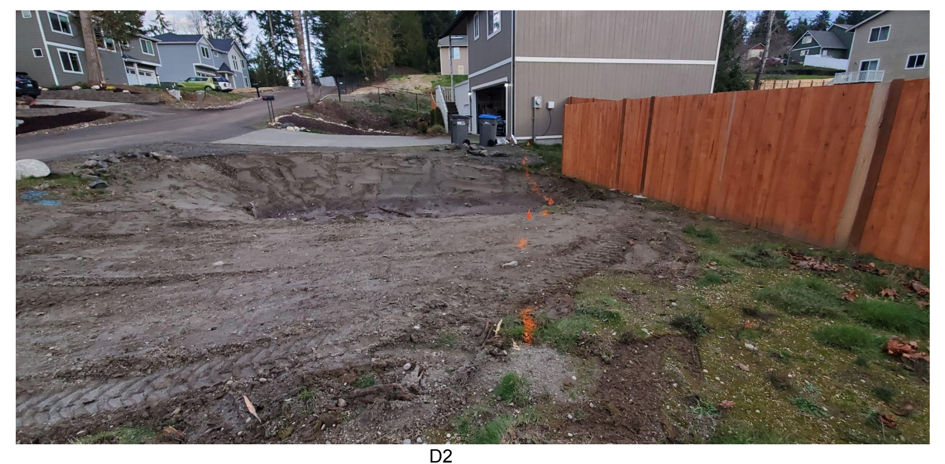
Photo D2 was taken February 1, 2022, after PSE and WAVE marked utilities after Mr. Freeland's excavation had been completed.