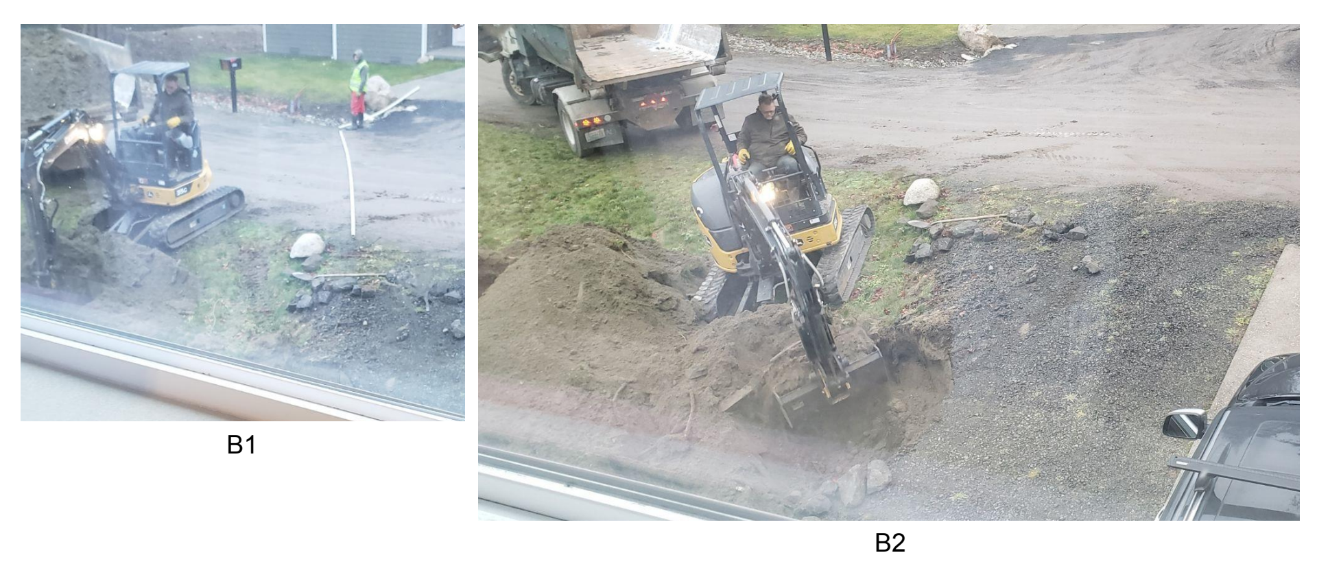
Photos B1 through B8 were taken on January 17, 2022. Jay Freeland is operating the excavator on my front yard/driveway. No utility markings are present on the date of excavation.