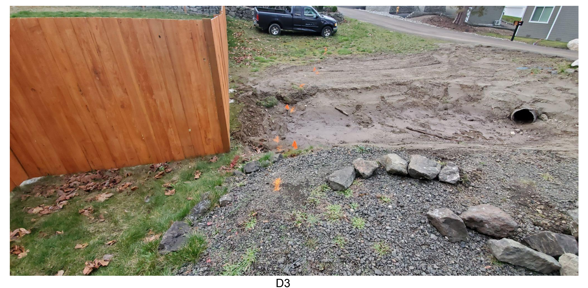
Photo D3 taken February 1, 2022 shows clear soil saturation and slight erosion close to marked utilities after a single rainfall.