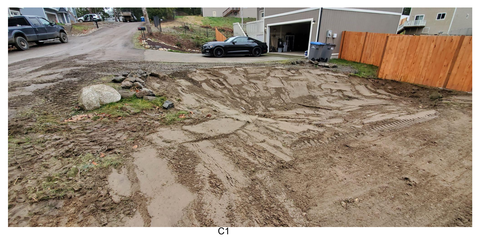
Photos C1 through C4 taken January 17, 2022 after Mr. Freeland completed his excavation. No utility markers are present and dig site nearly exposes concrete footers of the fenceline.