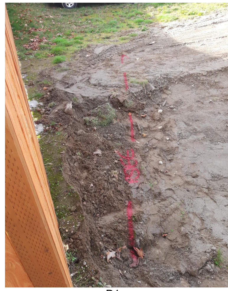
Photo D1 taken on January 28, 2022 by a PSE utility marking employee. The loose dirt lies right above where the electrical power line is located.

All Utility markings were requested by myself, Ethan Salo, on January 27th, 2022, several days after Mr. Freeland's excavation.