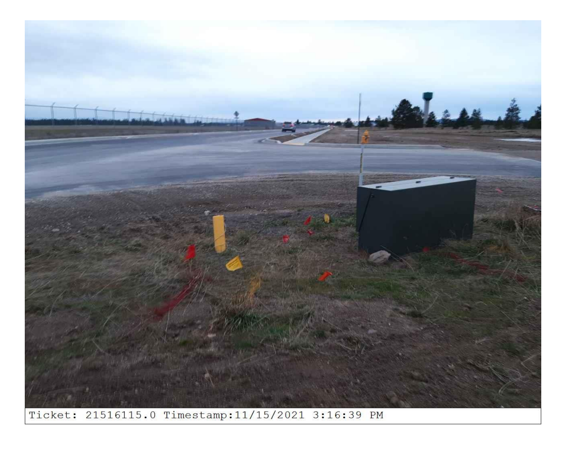
Exhibit D — Photo showing the intersection of Cedar and Enoch looking south. No white marks visible in photos.