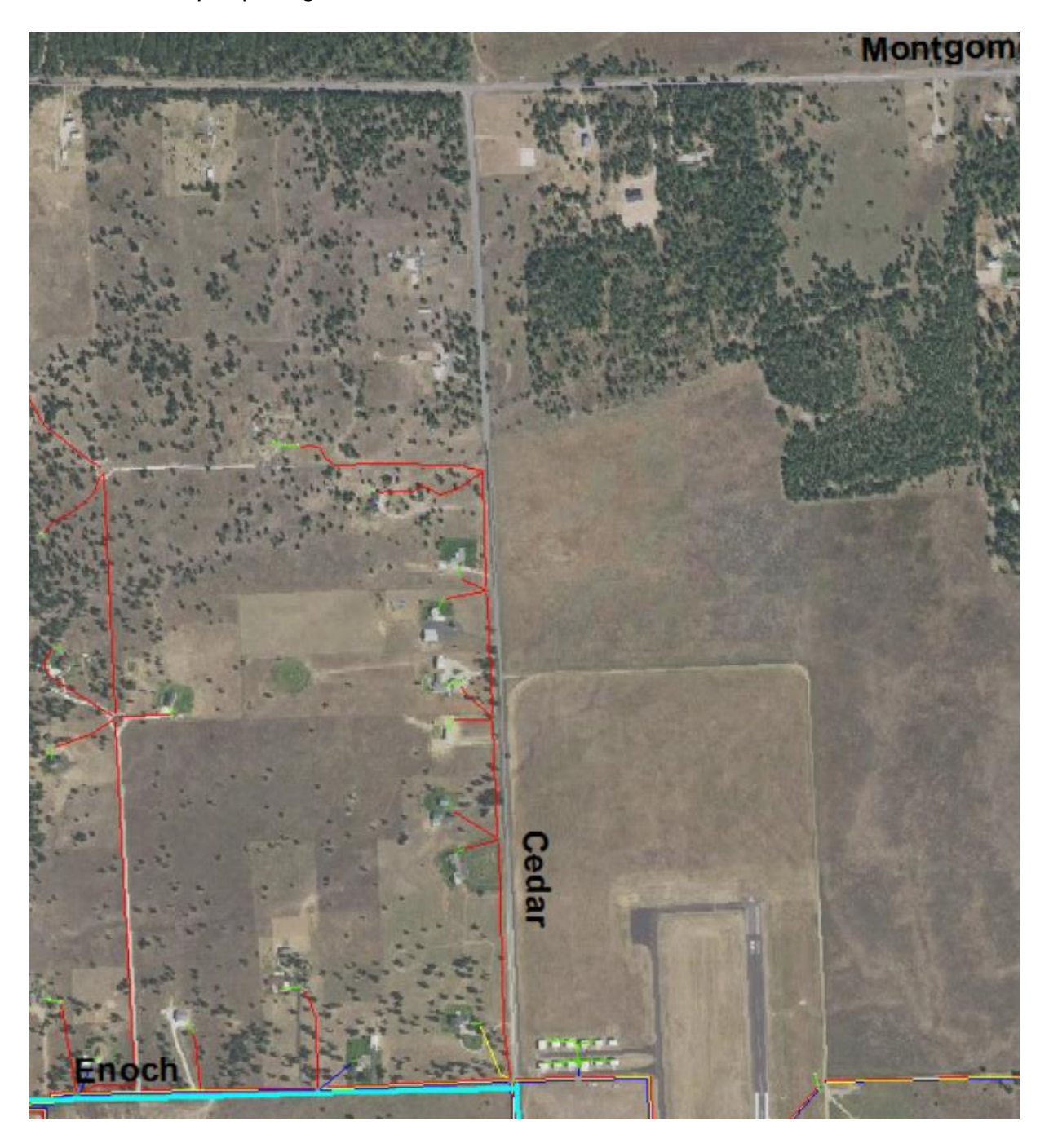
Exhibit A: Vicinity map of dig zone