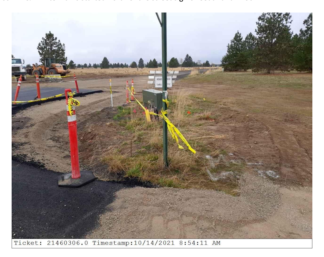
Exhibit J – M&L white marks started north of the street sign of Cedar and Enoch.