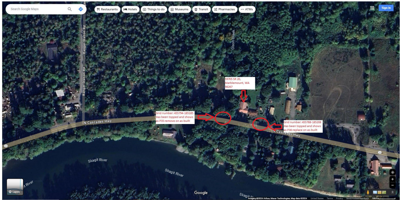
Satellite view of the poles with unclaimed attachments near 59705 State Rte 20, Marblemount.