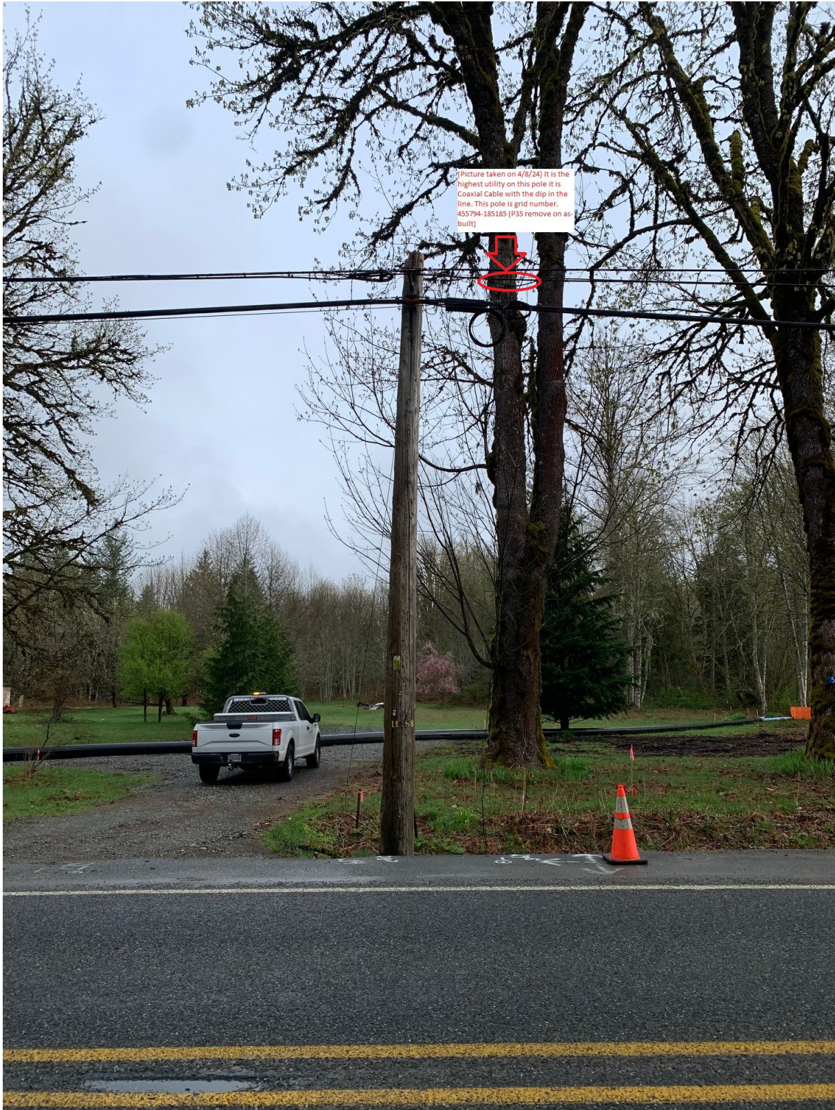
The unclaimed attachments are the highest attachments on the pole and are a coaxial cable.