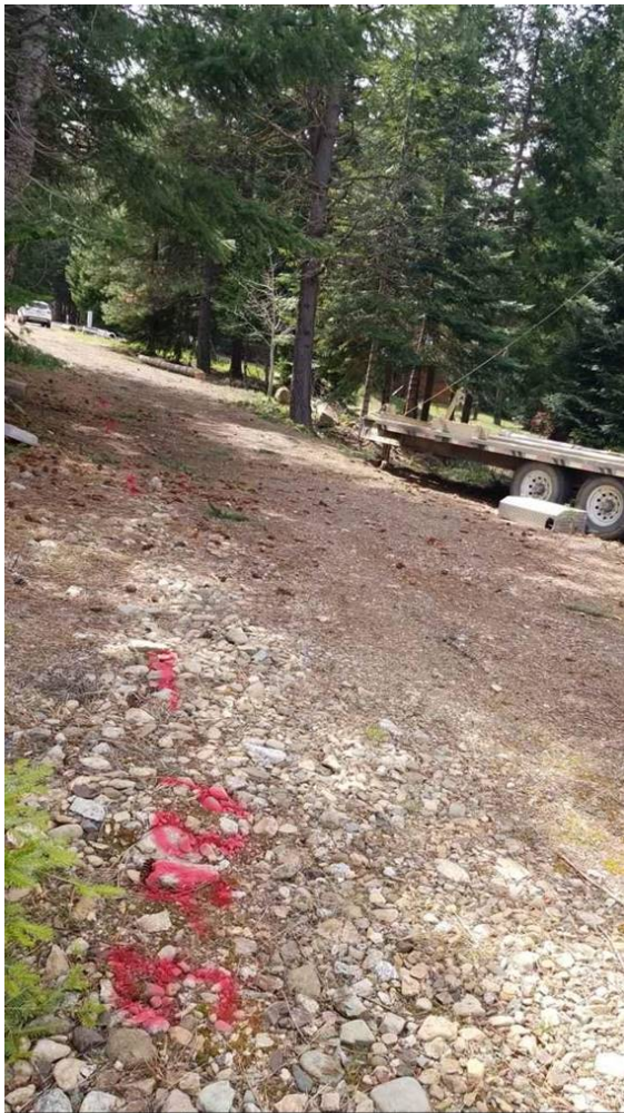
Ticket: 19158068.0 Timestamp: 4/25/2019 1:37:17 PM