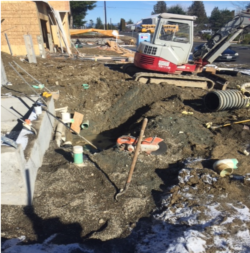
Lack of locate marks on the ground on 02/22/2018