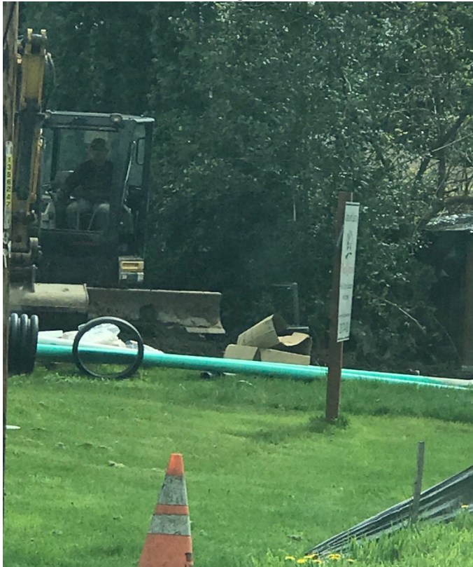
Lack of locate marks on the ground on 04/24/2019