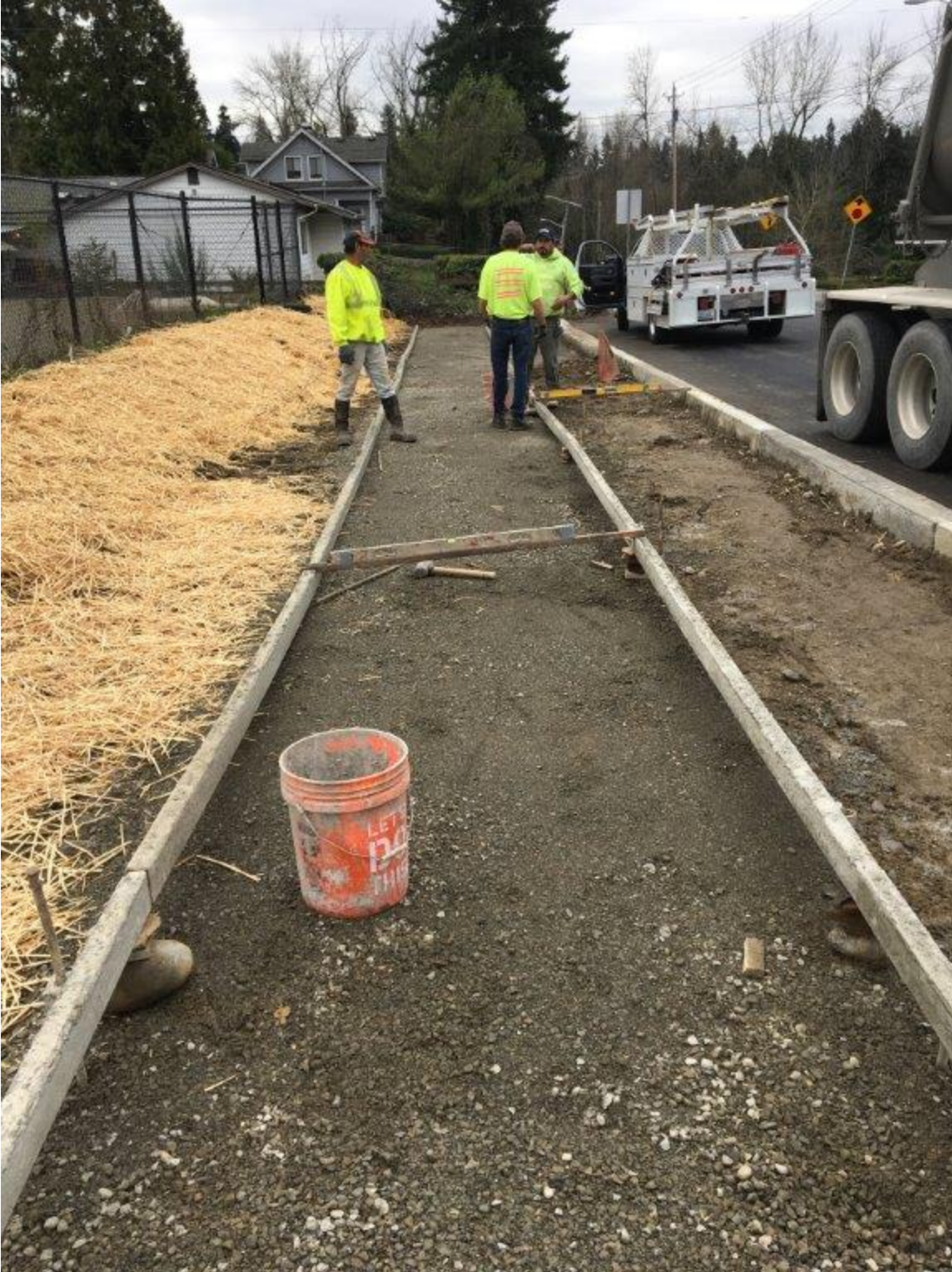
• Closer view of concrete forms and stakes