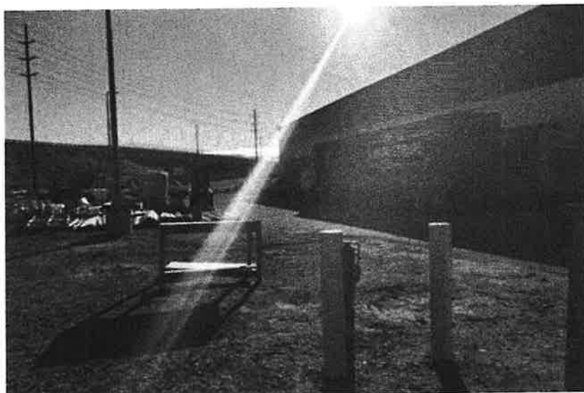
Olsson's area will need to be cleared eventually. They are still actively working in the plant so we will find alternate staging areas for dumpsters until this area is clear.