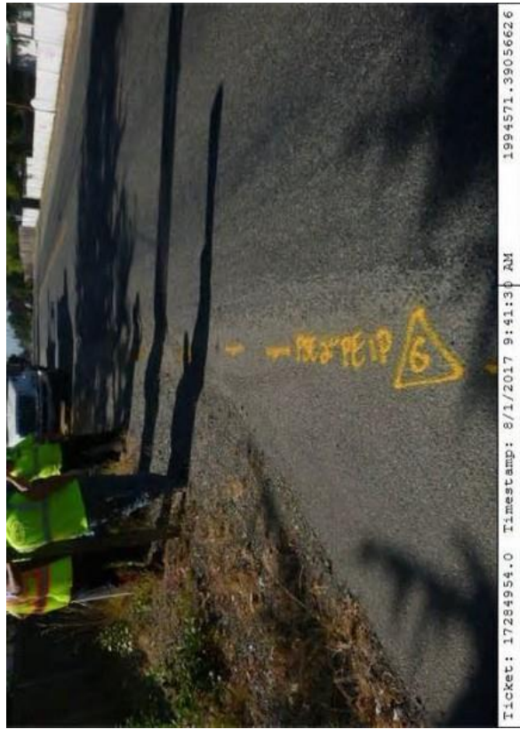
This photo is taken from the north facing south.