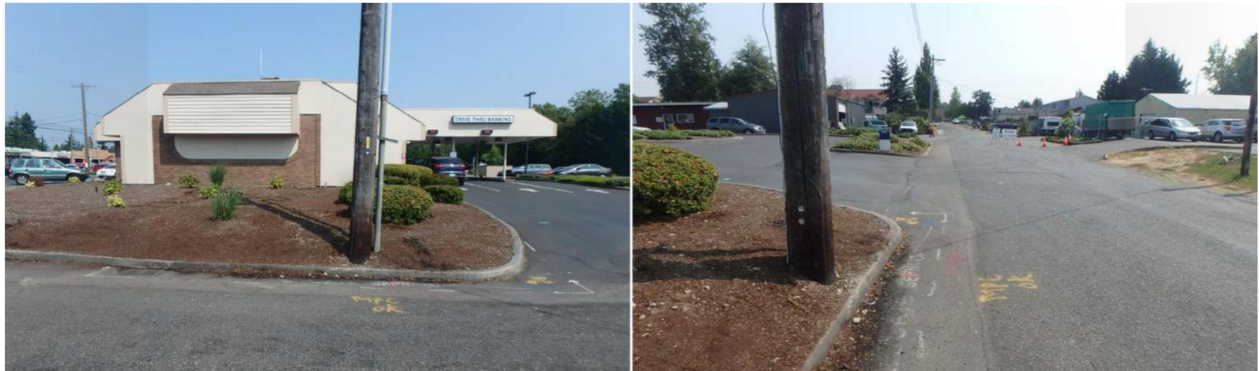
Photo showing white marked area and overhead view of white marked area

Excavation Polygon Coordinates Latitude Longitude Latitude Longitude Latitude Longitude (47.1665617, -122.4313831) (47.1666184, -122.4335611) (47.1667525, -122.4335557) (47.1666855, -122.4334860) (47.1666700, -122.4313831)