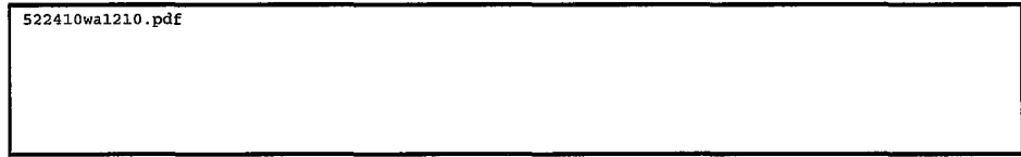
Name of Attached Document

<1210> Terms & Conditions of Voice Telephony Lifeline Plans