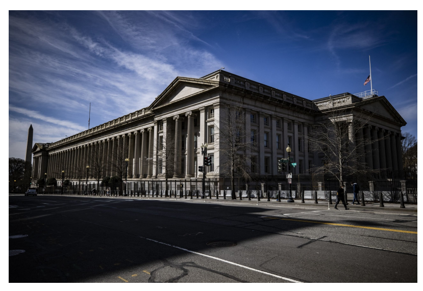
The U.S. Treasury building in Washington. Long-term Treasury yields help determine interest rates on everything from mortgages to corporate debt.

Partial unwinding of crowded trade helps drive yields down to levels few thought they would see at time of strong growth, inflation