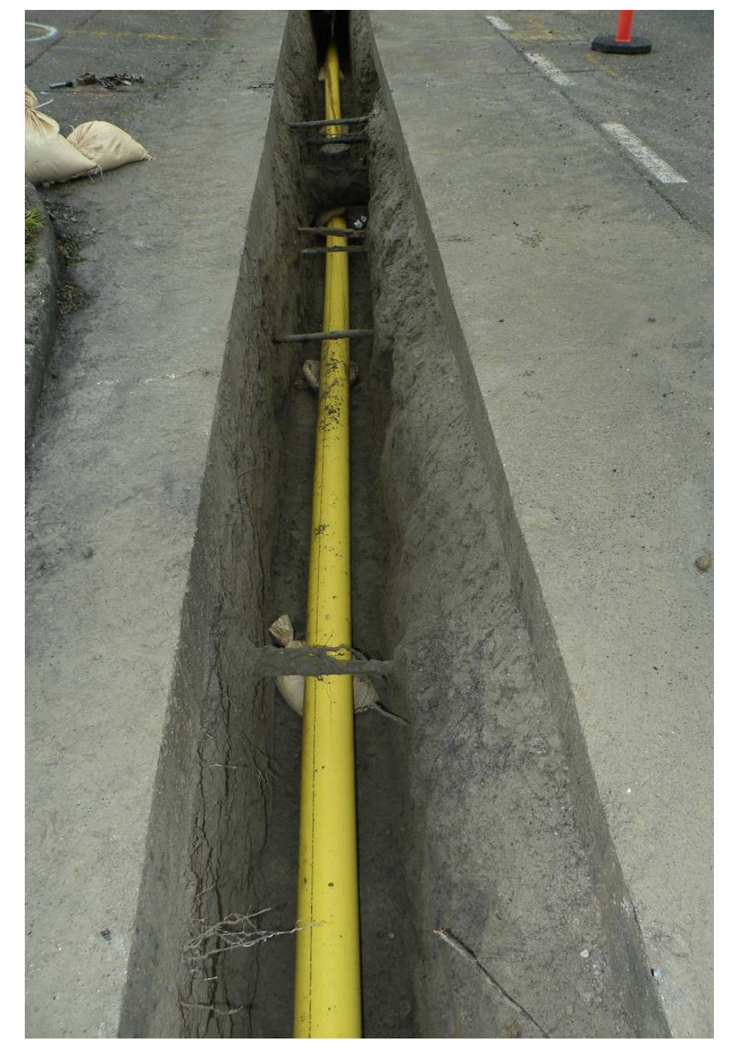
Figure 4-5: 6501 Beacon Ave S, 6-Inch Bare Steel Main Replacement, In-Service Expected 2010

1.7.5 Figure 4-5 illustrates the trench depth for six-inch PE pipe in accordance with PSE standards that require three feet of cover.