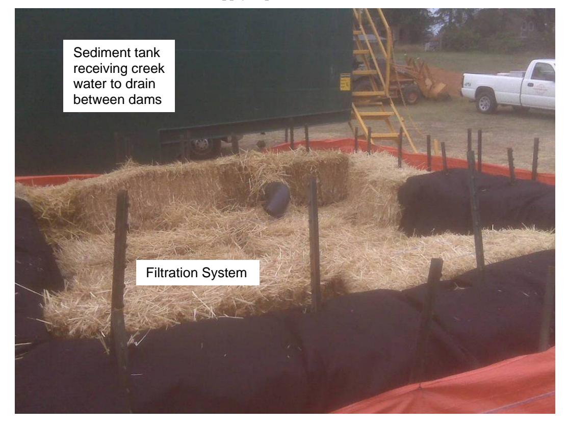
Figure 4-9: Frederickson 16-Inch HP Supply Pipeline, In-Service 2008

Figure 4-9 shows Clover Creek open cut crossing and the environmental protection steps that were required to preserve water quality and salmon migration. Geotechnical studies of soils indicated that conditions were not conducive to directional drill or traditional bore construction methods, therefore, PSE was required to open cut Clover Creek. Water that passed through the cut had to be filtered to meet water quality requirements. This was achieved by constructing upstream and downstream barriers – providing the water a place to settle before reentry to the creek.