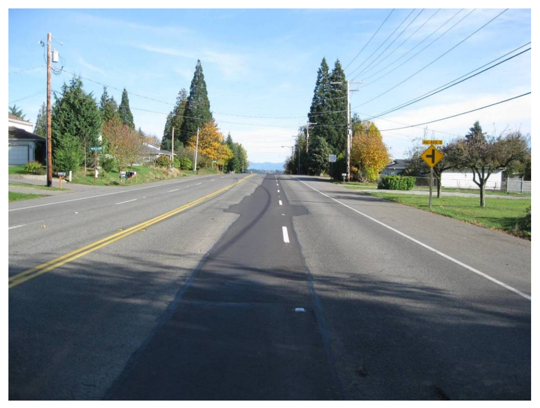
Figure 4-2: Kent Black Diamond Phase II Project, 16-Inch Diameter Supply Pipeline, In-Service October 2009

Historically, this patch would have been an acceptable final restoration practice. More recently and more frequently, as in this project, the Company was required to return to add roadway asphalt overlay which varied from one lane to five lanes, plus shoulders. This was at an additional cost of $2 million (yielding a total cost of $4.5 million for paving restoration).