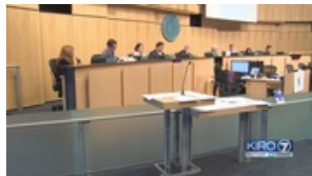
Should Seattle businesses pay a fee for labor inspectors?