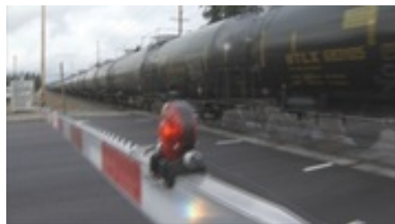
Marysville train crossing problems to get relief