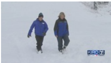
Stevens Pass could open on Thanksgiving