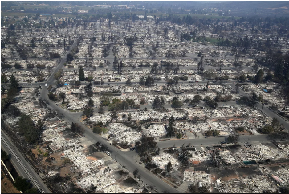
Aerial view of hundreds of homes in the Coffey Park neighborhood of Santa Rosa.

Then there was the recent state-sponsored DEW attacks and premeditated acts of pyro-terrorism staged throughout the state of California during November and July of 2108 (as well as the same wildfire seasons of 2017). This is where 5G will be utilized more frequently as a means of advancing the UN agendas*, and especially enabling land and resource theft by powerful corporate interests (see Addendum below).