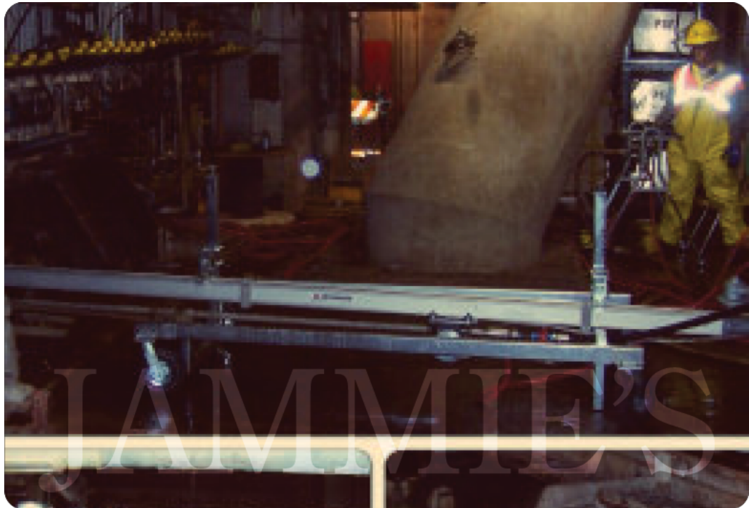
Ultra High Pressure