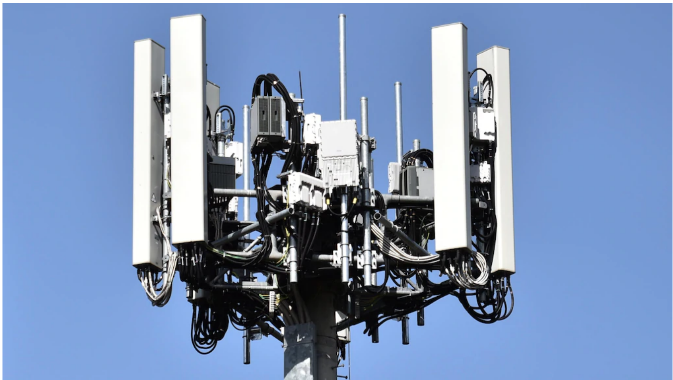
📷 'Once deployed it will not be possible to avoid 5G radiation exposure ... our environment will be very much saturated with low-power millimeter-waves in order for 5G to perform correctly.'