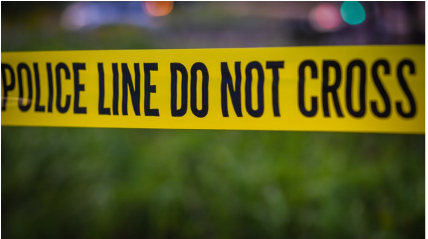
FILE - crime scene tape

SUMNER, Wash. – A train hit and killed a man in Sumner early Thursday morning.